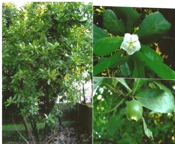
Figure 1: Photographs of X. Uliginosa

Nature has provided a treasure trove of phytoresources for curing all ailments of mankind 1 . Phytotherapy have become more popular in recent years because it has been verified that they do not have any side or toxic effects as compared to the modern medicine 2 . In recent years, due to degraded environment and fast urbanisation and big population, climate change and fast disappearing of plant species and ethnic practices occurs. Exploration of newer source of vegetation especially unexplored underutilised local food resource have become fascinating area of interest for bringing health care and sustainability. Exploration, documentation and through literature survey revealed an interesting fact that the plant is becoming more popular in curing various ailments and also used as vegetable. Very little attempt have been made to verify its efficacy through scientific screenings. Hence it is necessary to update the information in a review form to pinpoint the underexploited potential of this plant species.