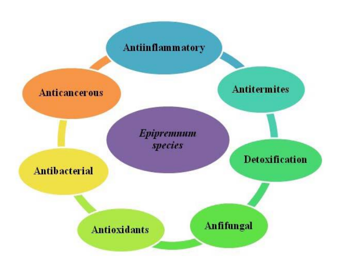
Figure 3: Ethnomedicinal and pharmacologic properties of Epipremnum species <sup>54</sup>

extract is effective against grass bacillus, and therefore the root extract with resolvent is effective against B.cereus.<sup>20</sup>