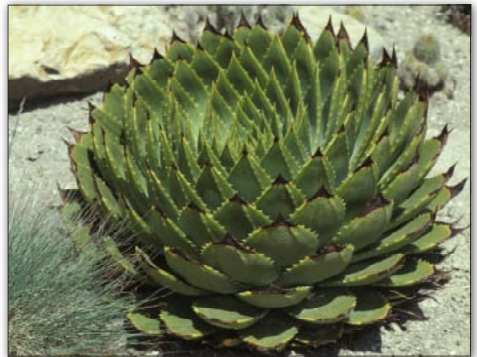
One of the most beautiful and collectable of all aloes is Aloe polyphylla , seen here growing at Hortus Botanicus Nursery near Fort Bragg, Calif.

flowers, and medicinal properties, aloes originated around the African continent. They are native to sub-Saharan Africa, the Saudi Arabian Peninsula, and to many islands of the western Indian Ocean, including Madagascar. The center of diversity for aloes is South Africa, which hosts more than 120 species and has a rich heratige the plants.