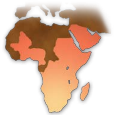
The distribution of the genus Aloe is shown in orange.

or form stems which may be single, tree-like, or branched, shrub-like. Most stand perfectly upright while a few creep along the ground. Even though they are now grown around the world for their beautiful forms,