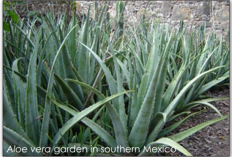
Aloe vera garden in southern Mexico

Medicinal Aloe. Aloe vera is not hardy in Davis, but it is readily available and easy to grow as a potted plant. This aloe should be grown outdoors in a bright but protected spot from April through mid-November and then brought inside when the nighttime temperature starts regularly dipping below 50°F. When indoors, they should be placed next to a very bright window, and the watering reduced so the pots dry out completely between waterings.