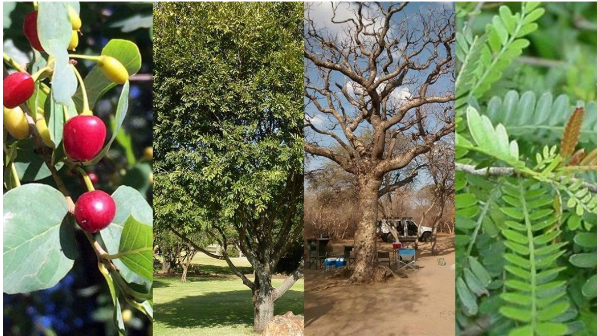
Left to right: Berchemia zeyheri , Diospyros mespiliformis , Schinziophyton rautanenii (Images: Wikimedia Commons) and Umtiza listeriana (Image: PlantZAfrica - SANBI, Creative Commons)