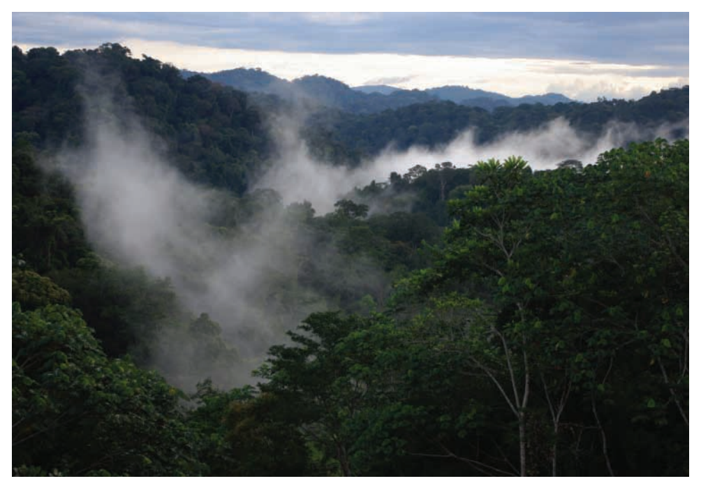
Figure 1. Monts de Cristal National Park, view from Tchimbélé.

visited by botanists and is one of the most densely botanically collected areas in Gabon (Wieringa and Sosef 2011). However, new species have been regularly described from the national park (e.g. Ječmenica et al. 2016; Stévart et al. 2014), including a new genus of Annonaceae, Sirdavidia (Couvreur et al. 2015) which was recently awarded the top 10 new species of 2016 (International Institute for Species Exploration 2016). Here, we describe two new species collected during a botanical trip to the Monts de Cristal National Park in June 2016, one Annonaceae and one rattan.