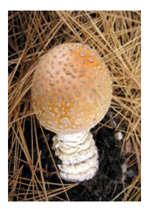
This specimen of Amanita muscaria var formosana this was collected in Piscataway, on the Busch campus of Rutgers University.