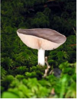
Agaricus sp. In the New Jersey