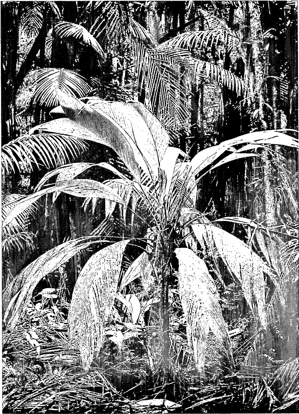
FIG. 2. Asterogyne guianensis in its natural habitat, growing under Euterpe oleracea .

fleshy and juicy; seed narrowly ellipsoid, 20 \times 8 mm, with homogenous endosperm, germinating in 140 days; eophyll entire with bifid apex.