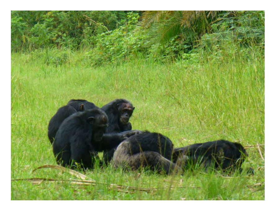
Figure 2. Kasongoire adult male chimpanzees grooming outside the forest, in the gap between a large sugarcane crop and the edge of the forest fragment.

The sugarcane, grown primarily by Kinyara Sugar Works Ltd, dominates the landscape and is grown continuously from the outskirts of Budongo Forest Reserve southwest to Hoima District, and southeast past Kasokwa Forest Reserve, encompassing an area of over 500km<sup>2</sup>. The results of this pilot indicate that it has become a major part of the Kasongoire chimpanzees' diet, at least for part of the year, and appears to largely replace wild fruits. As a result of this important finding, this study will monitor wild fruit abundance and availability along with sugarcane cycle stage to understand how the sugarcane specifically impacts the ranging, behaviour and socioecology of the Kasongoire chimpanzees.