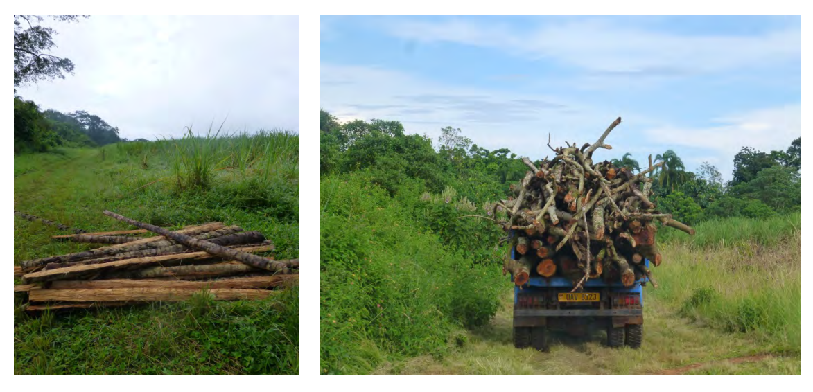
Figure 3. Examples of deforestation in the Kasongoire forest fragments. Left: A pile of Phoenix reclinata cut down by forest guards; right: a truck loaded with Pseudospondias microcarpa and Myrianthus holstii .

Therefore future work needs to focus on linking these two ideas in the minds of the villagers: that current forest clearance – small-scale but constant and especially close to areas where women and children frequent – will likely increase negative interactions with chimpanzees. I have been invited by local leaders to talk in the village schools during the main study, which will provide an opportunity to discuss both deforestation and behaviour around the chimpanzees to help avoid future attacks and improve perceptions of the chimpanzees by the villagers.