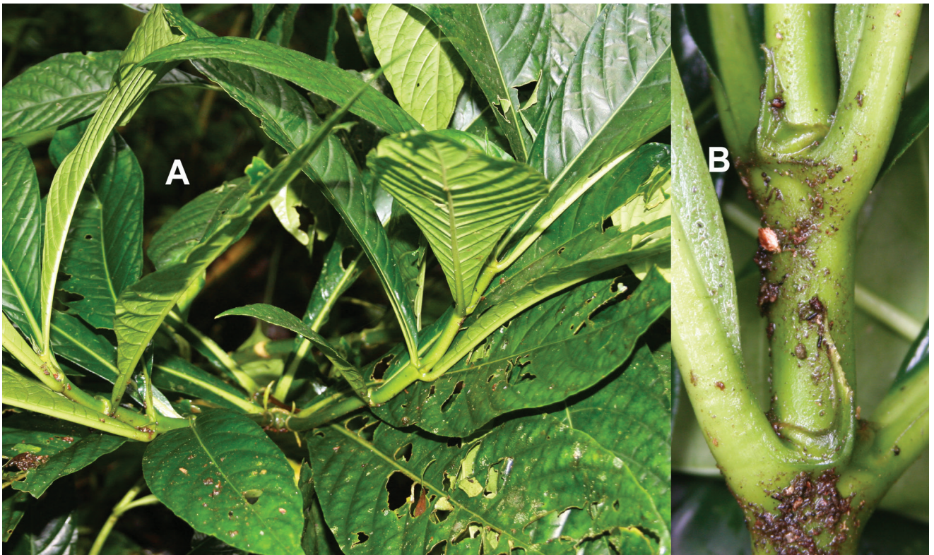
FIGURE 3. Airosperma grandifolia Valetton. Vegetative structures. A , apical view of branched shoot; B , stipules. Valetton (1912) had described the stipules as early-falling, but in all individuals examined in the field they are persistent. A–B from W. N. Takeuchi, D. Ama & A. Gambia 25061.