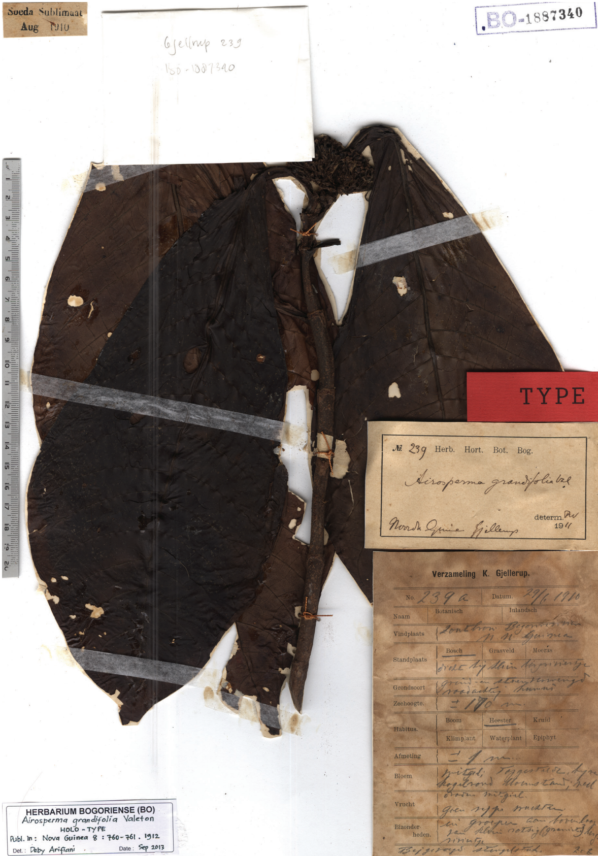
FIGURE 1. Airosperma grandifolia Valeton. Photograph of the holotype. From K. Gjellerup 239 (BO).