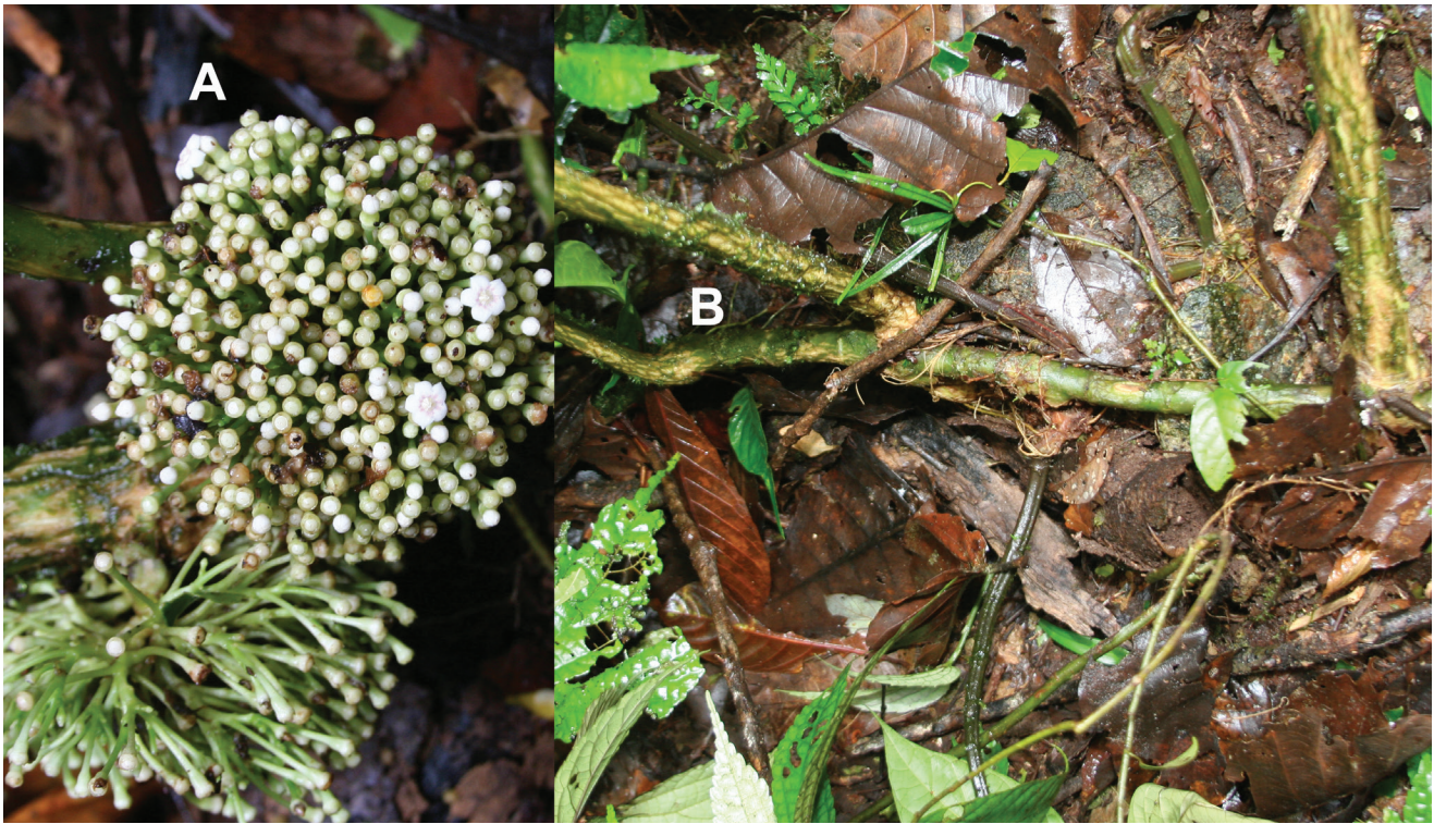
FIGURE 4. Airosperma grandifolia Valetton. A , cauline inflorescences at ground level; B , ascending stems (3 shown) developed from a surface runner. A–B from W. N. Takeuchi, D. Ama & A. Gambia 25061.