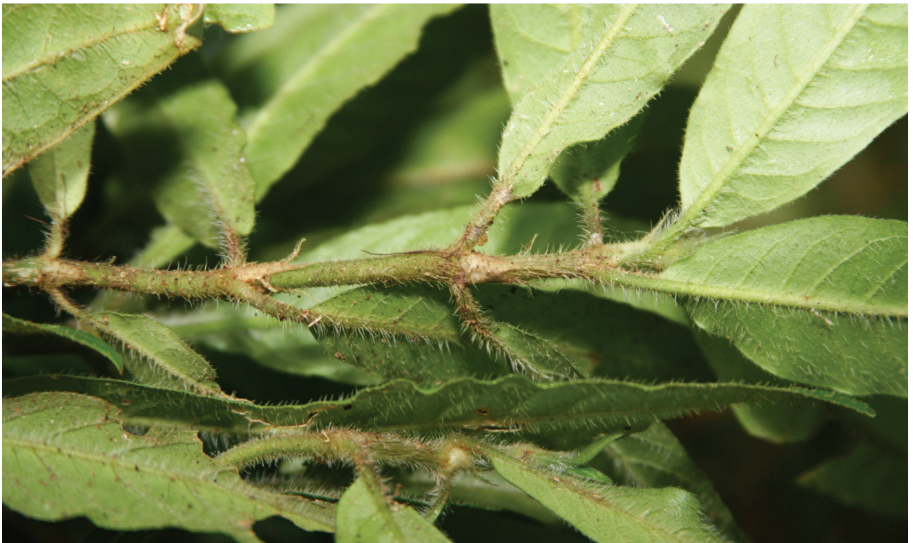
FIGURE 7. Psychotria augustaflussiana W. N. Takeuchi. Vegetative structures. From W. N. Takeuchi, D. Ama & A. Gambia 25405.