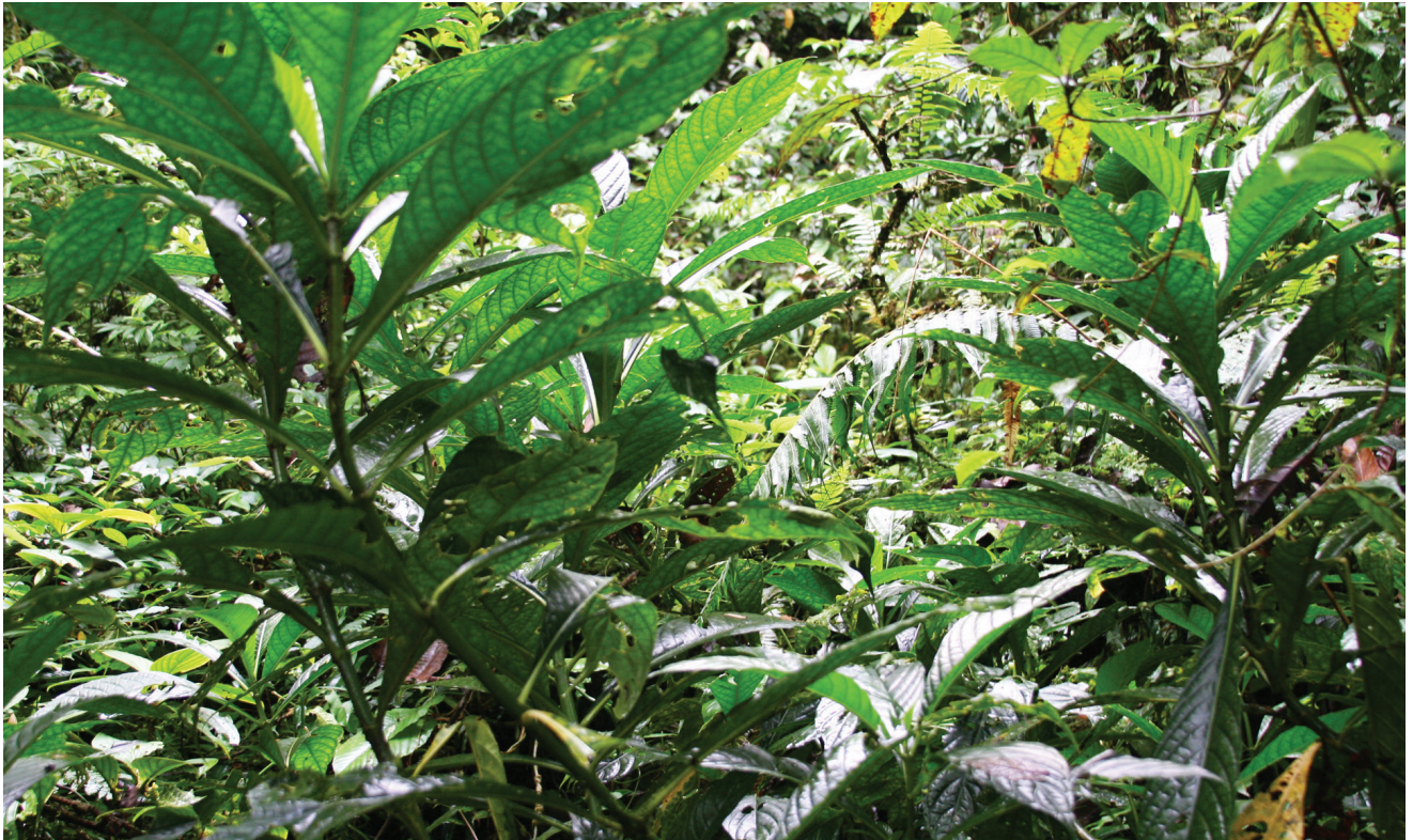
FIGURE 2. Airosperma grandifolia Valetton. Ascending stalks, ca. 1 m tall. From W. N. Takeuchi, D. Ama & A. Gambia 25061.