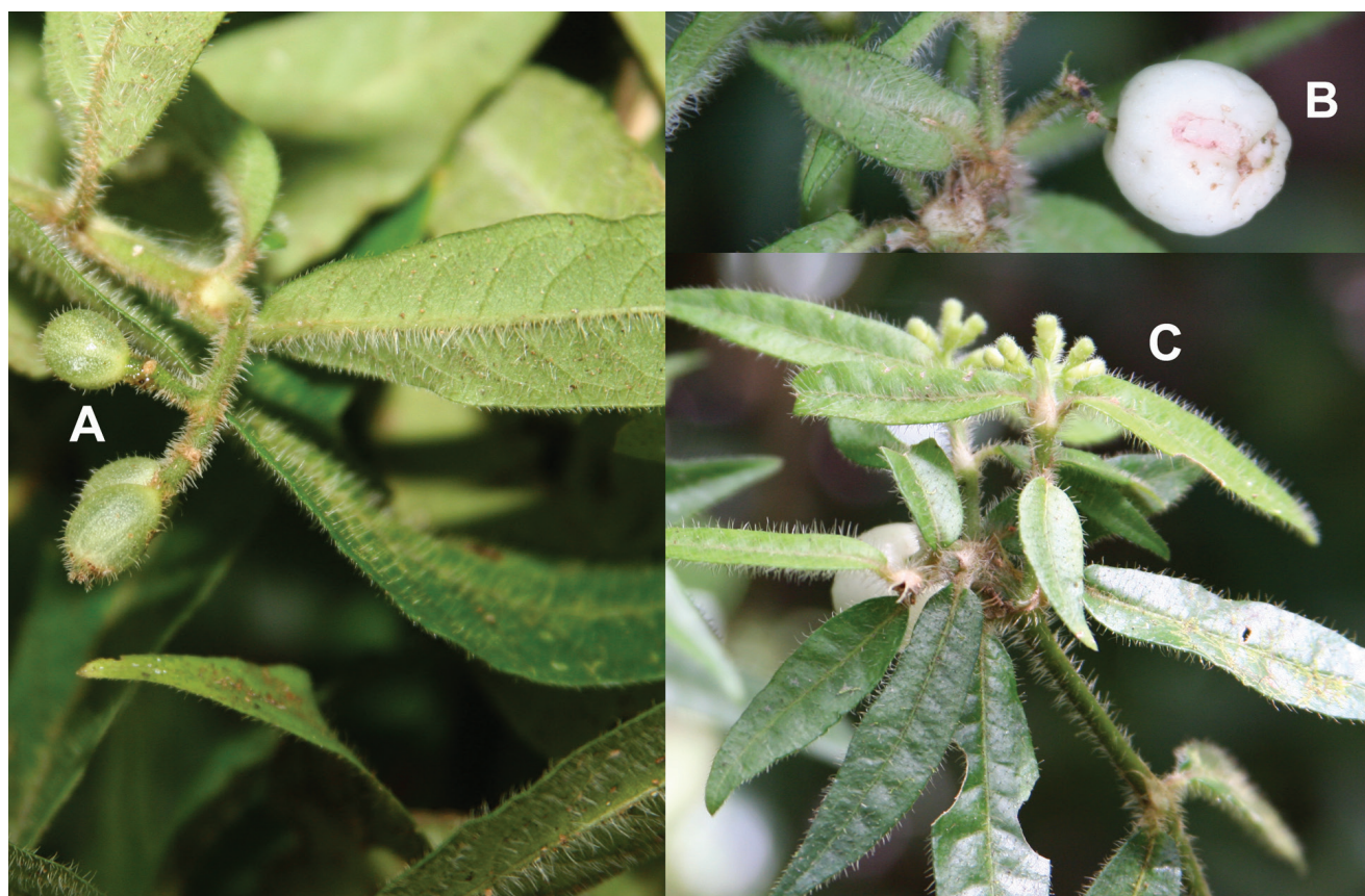
FIGURE 8. Psychotria augustaflussiana W. N. Takeuchi. A , immature fruits; B , mature fruit; C , pre-anthetic flowers. A from W. N. Takeuchi, D. Ama & A. Gambia 25405; B–C from W. N. Takeuchi, D. Ama & A. Gambia 24923.

Field characters: Understory subshrubs, gregarious; all parts densely white-pilose; branches opposed, horizontal, fragile; stipules white; leaf-blades chartaceous, adaxially mid-green, abaxially pale green; inflorescence/infructescence erect or nodding, axes green; fruits spongy, dull white, irregularly shaped, globular, 13–15 × 13–14 mm in vivo; endosperm white with brown ruminations from the margins.