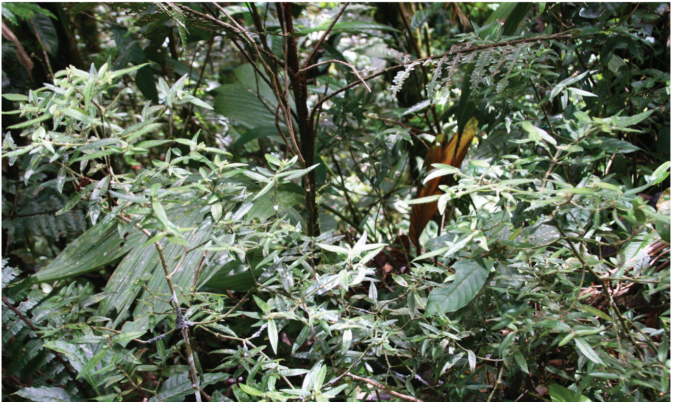
FIGURE 6. Psychotria augustaflussiana W. N. Takeuchi. Habit, 0.5 m subshrubs (two shown) in forest understory. From W. N. Takeuchi, D. Ama & A. Gambia 24923.