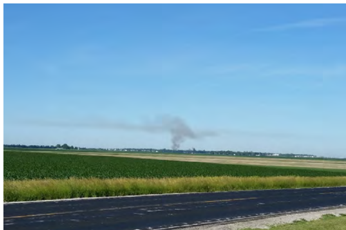
Smoke that flattens out can indicate the presence of an inversion. Michelle Wiesbrook, University of Illinois.

to identify but smoke that flattens out can indicate the presence of one. They are more likely to occur on clear nights with little to no cloud cover. They begin in the evening, build in intensity overnight, and generally dissipate in the morning once the temperature rises 3 degrees so we recommend applicators wait until then to spray.