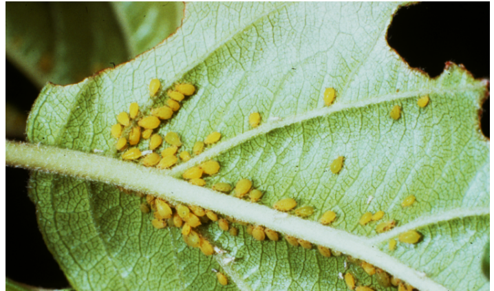
Aphids.

Aphids also produce sugary droppings called honeydew. The honeydew coats the leaves giving them a shiny, sticky appearance and supports sooty mold growth. Aphids are primarily controlled to prevent honeydew, rather than their feeding injury.