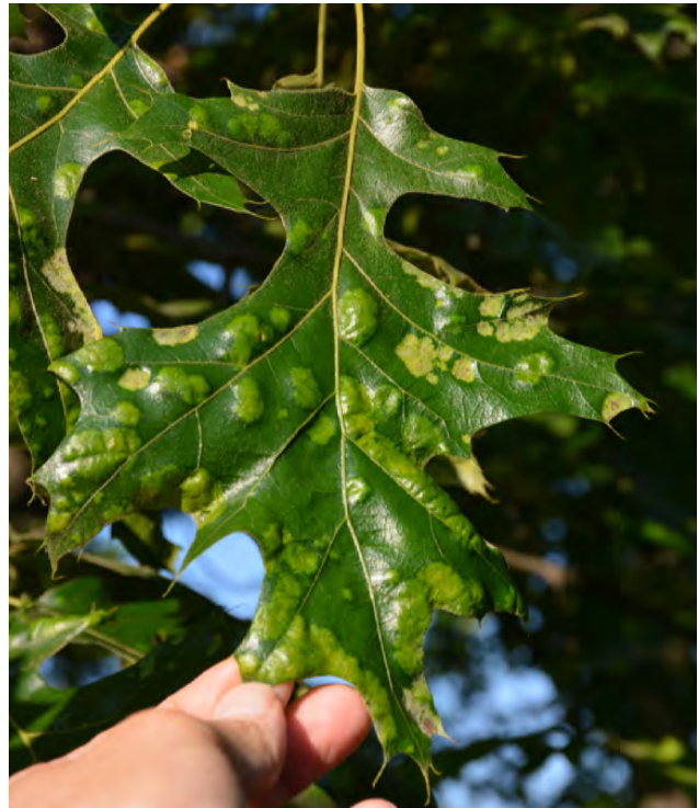
Oak leaf blister on black oak, June 2021. Travis Cleveland, University of Illinois

Symptoms begin as circular, raised spots on the upper surface of the leaf, as seen in the pictures. As the symptoms continue to develop, they become more distinct and appear as scattered blister-like, puckered, or raised areas on the leaves. Symptomatic tissues are often thickened and have a light green color, which transitions to reddish-brown as the season progresses. Severely diseased leaves may drop prematurely.