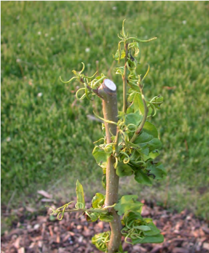
Herbicide injury on pear.

cation as it can be washed off. Here again, the label will provide specifics on a rain-free period. Watch your radar for rain, record your wind speed on site at spray boom height with a weather meter. The weather app on your phone is super handy but wind speed can be different from where you are compared to where it is officially recorded. Keeping good application records is just good insurance in case something goes wrong or plants nearby show strange growth afterwards.