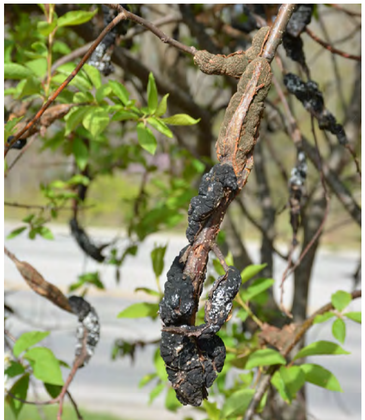
Black knot on Schubert chokecherry.

Early symptoms of the disease are easily overlooked, appearing in autumn as swellings of the current year's growth. Infected branches continue to swell during the following spring, eventually causing the bark to rupture, revealing corky, olive-green fungal tissue. By the fall, affected tissues are hard, brittle, rough, and darken to a characteristic coal black color. Affected branches often fail to leaf out the following spring or wilt and die by early summer. The infected branches that remain living have black knots that elongate on a perennial basis. Some knots can develop to be one foot or longer. The disease becomes more severe with each growing season. Black knot will not typically kill the tree, but causes deformed growth if left unchecked.