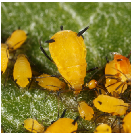
Oleander aphid (Aphis nerii).

There are many species of aphids in Illinois and they feed on a large range of host plants. Aphids suck fluids from stems and leaves while the leaves are still expanding. This can result in discoloration, leaf-curling, mis-