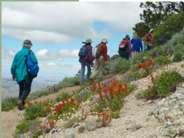
Patriot Garden on Mores Mountain.

Jean was very good at pointing out rare plants of numerous species such as Senecio ertterae , Mentzelia packardiae , Ivesia rhypara var. rhypara , Astragalus sterilis and Trifolium owyheense .