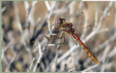
Variegated Skimmer in Reynolds Creek.

wildlife enthusiasts. Many of the interesting plant species in this sage-steppe habitat were post-bloom, but flowers were still visible on many plants. Higher elevations had large clumps of Penstemon cusickii and P. speciosus in full bloom. The very rare Penstemon miser had a few blooms left on its 'martian' tuffaceous hillside.