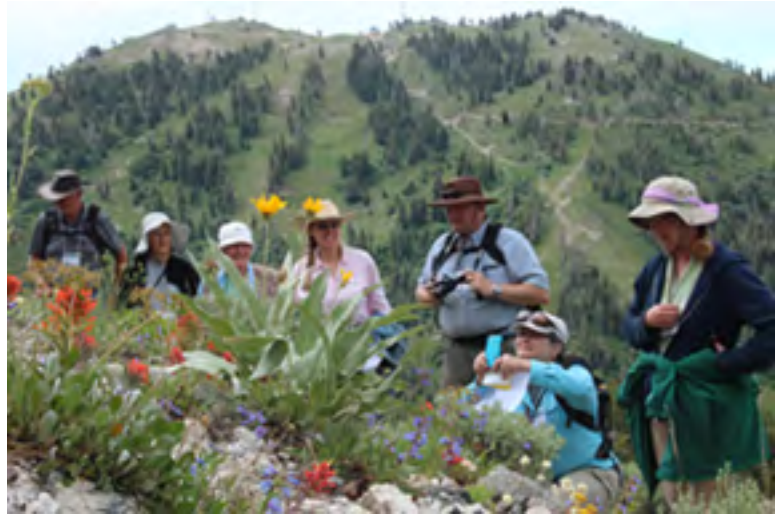
Participants with Bogus Basin in the background, photographer unknown, on Mores Mountain.

seen scattered through the hills. Penstemon attenuatus was a common find. Penstemon payettensis , P. humulis , P. fruticosus and P. wilcoxii were also seen. One of the highlights of the trip was seeing the very rare Mimulus cusickii and Lewisia sacajaweanae . Those that made it to the top of the loop were able to see vistas of Boise's Treasure Valley and a large population of Penstemon attenuatus .