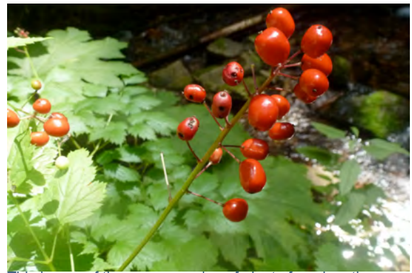
This is one of the many species of plants found on the Calypso Chapter's July Coal Creek hike. This is the poisonous red baneberry ( Actaea rubra ).