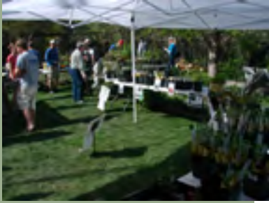
Pahove Chapter annual plant sale. Photo submitted by Karie Pappani.