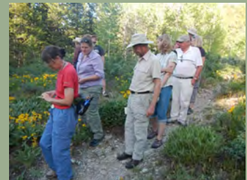
Arrowleaf Balsamroot blooming along the nature trail near Justice Park.