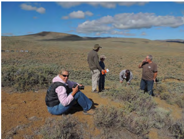
A group of photographers on the P. miser tuffaceous hillside in Succor Creek.

alpine ghost town of Silver City. Her tour started in the low, dry Owyhee Front. The word 'dry' is an understatement, with mostly parched, post-bloom plants observed at these lower elevations. Participants were however able to get some of the best pictures during this section of the tour with subjects being insects, lizards and rattlesnakes. A very rare Penstemon janishiae was seen in the fruiting stage. Many types of cacti were also a highlight of the lower elevations. In the higher elevations, around Silver City, we found large patches of Penstemon speciosus in full bloom. P. deustus , P. attenuatus and P. fruticosus were also seen at this high elevation.