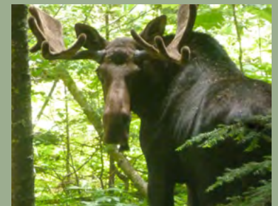
Someone else interested in the Calypso Chapter Coal Creek hike.