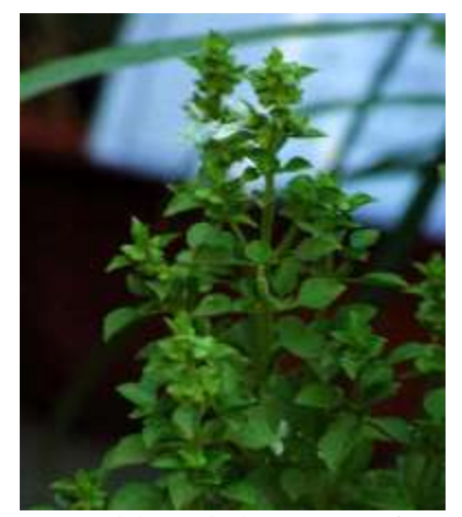
Fig. 1: Ocimum kilimandscharicum Guerke.

antinociceptive, anti-fungal, antipyretic, phototoxic activity, antiaflatoxigenic, anti-diarrheic, \alpha -amylase inhibitory etc. which have been shown in Table 1 [11-45, 61-75].