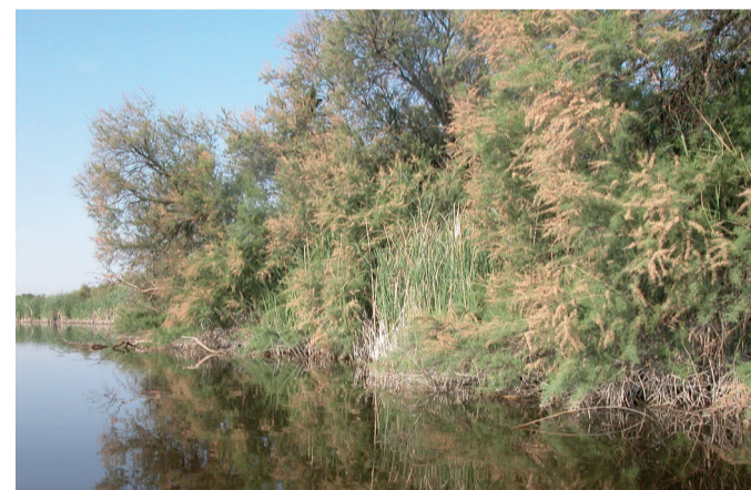
Fluvial vegetation with Canary Islands tamarisk ( Tamarix canariensis ).

Three species of fungi, Botryosphaeria tamaricis , Diplodia tamarascina and Leptosphaeria tamaricis , can form cankers and cause branch dieback on tamarisks. The latania scale ( Hemiberlesia lataniae ) and oystershell scales ( Lepidosaphes ulmi ) are two insects which frequently infest these species 20 . Some species, principally salt cedar ( Tamarix ramosissima ) Chinese tamarisk ( Tamarix chinensis ), small-flower tamarisk, French tamarisk and their hybrids, are considered as invasive weeds in the United States, and have been the target of many control programmes since the 1960s 21 .