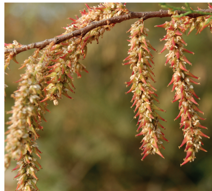
Reddish-orange inflorescences of the African tamarisk ( Tamarix africana ).

They also have other important properties, being classified as medicinal plants. The galls and bark are used as astringent. Many species, such as the French tamarisk, also have tonic, diuretic, stimulant and stomachic action 17 . They are also used for tanning and dyeing purposes 5, 18, 19 . Some tamarisks are melliferous and are used as a sugar substitute 5 .