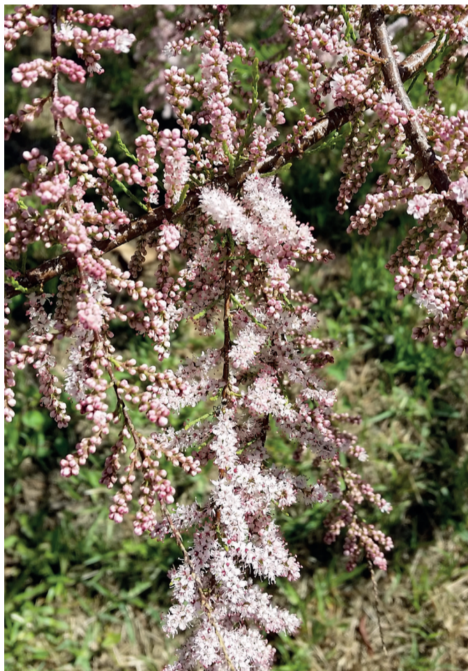
Pink flowers of an ornamental French tamarisk ( Tamarix gallica ) in a garden.

waterways and on sandy floodplains, especially where their roots can access underground water 9 . They grow best in alkaline soils, but also tolerate acidity 12 . These plants are found on non-rocky silt loams and clay loams of high organic matter along streams, bottomlands, pond margins, banks of drainages and washes and other wet environments in arid and semiarid regions 13, 14 . Tamarisks are not shade-tolerant 14 .