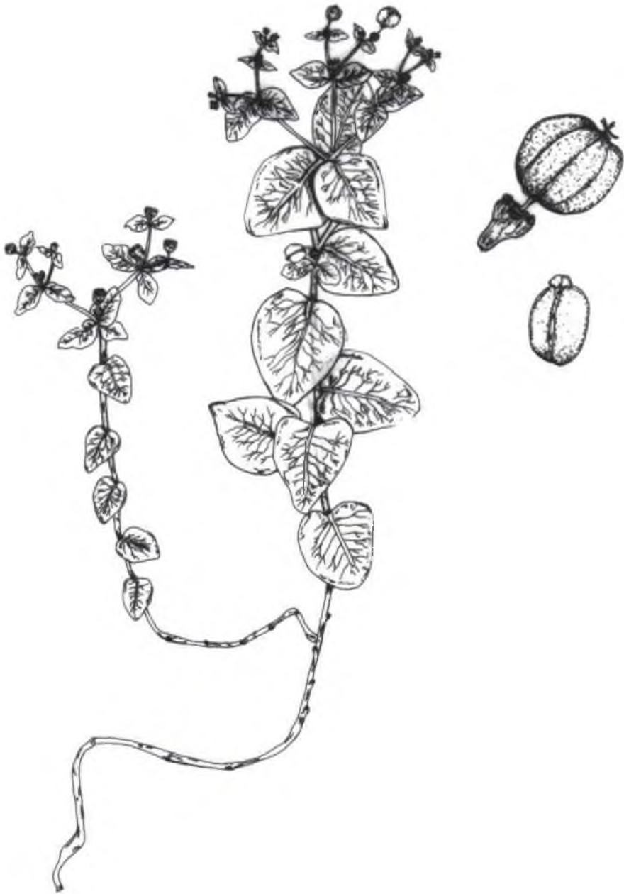
Fig. 1: Euphorbia rosularis (x 0.67); fruit and seed (x 3.3).