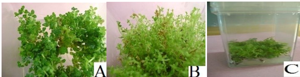
Fig. 2. Shoot multiplication from regenerated shoots. (A) 0.5 mg/l BAP + 0.01 mg/l TDZ; (B) 0.4 mg/l BAP + 0.2 mg/l GA 3 ; (C) 2.0 mg/l BAP.

Means connected by the same superscript letters (a-o) in the same column are not significantly different at 5% probability level. Mean values are indicated as ± SE.