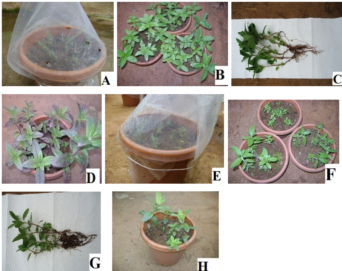
Fig. 4. Stages of acclimatization for in vitro and microshoots. (A, E) Plantlets covered with polythene bags; (B, F) Four weeks after acclimatization; (C, G) Rooted shoots after four weeks; (D, H) After a month, grown in the external environment.