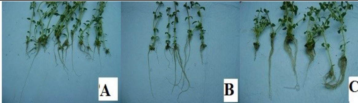
Fig. 3. Shoots of P. edulis rooted on rooting media containing different concentrations of PGRs. (A) 0.3 mg/l IBA; (B) 0.6 mg/l IBA and (C) 2.0 mg/l IBA.