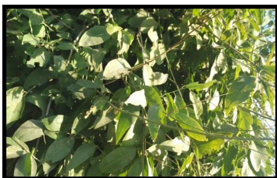
(3) Leaves part