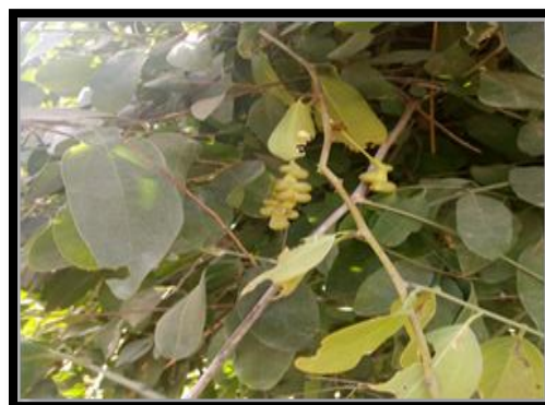
(4) Fruit part