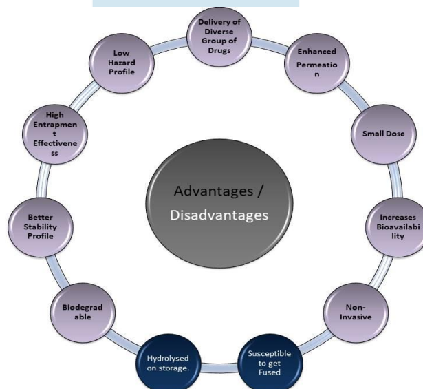
Figure 2: Advantages and Disadvantages of Phytosomes[3]