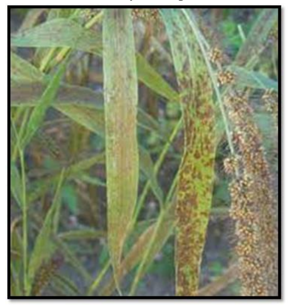
D. Rust in Foxtail Millet