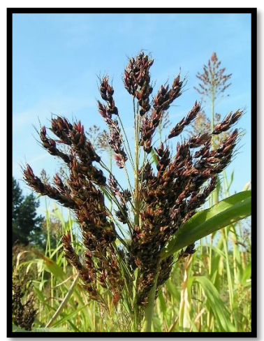
E. Grain mold in Sorghum