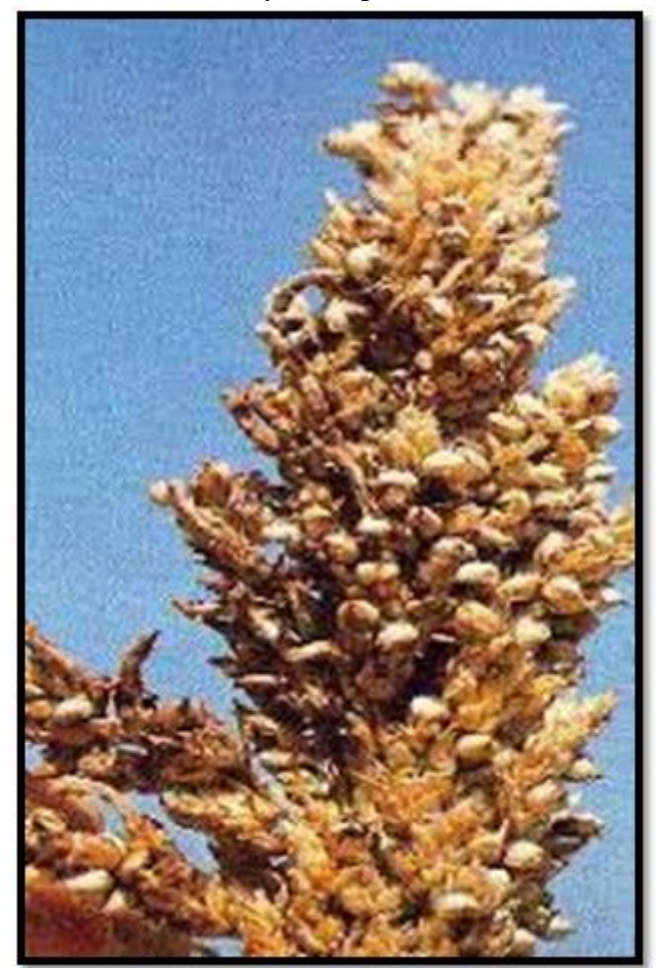
B. Ergot in Sorghum