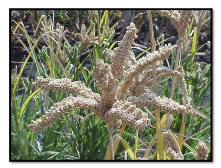
A. Blast Disease in Finger Millet

Finger millet Downy mildew otherwise known as crazy top downy mildew is a type of fungal infection on finger millet. The fingers are replaced by a leafy structure which are bushy (Nagaraja et al., 2016). The important symptom of this disease is the earheads get converted to leaf like appearance causing sterility. There is no white cottony growth as seen in other downy mildew disease (Nagaraja et al., 2016). This spreads to the spikelet from the base and later the earhead will look like a bush – 'green ear' (Das et al., 2017).