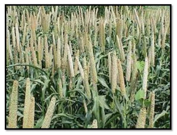
C. Downy Mildew in Pearl millet