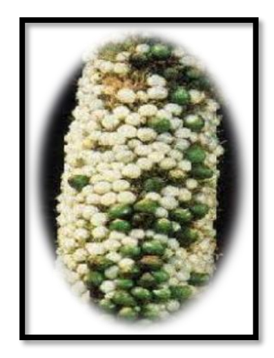
F. Smut in Pearl Millet Figure 2: Fungal diseases in Millets