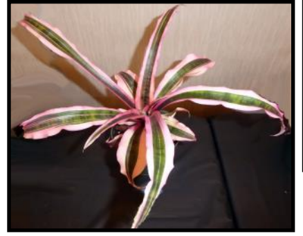
Cryptanthus Burgundy Blast (AM) Exhibitor: Ed Edmiston