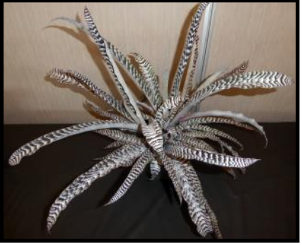
Cryptanthus 'Living Colors' (B) Exhibitor: Ruby Adams