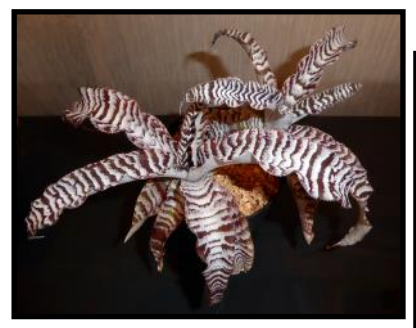
Cryptanthus Absolute Zero (B) Exhibitor: Patricia Buenaventura