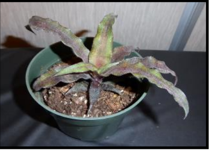
Cryptanthus Lindsey Stowe (B) Exhibitor: Gordon Stowe