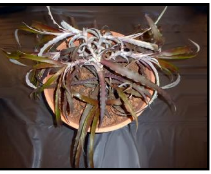
Cryptanthus warren-loosei (B)