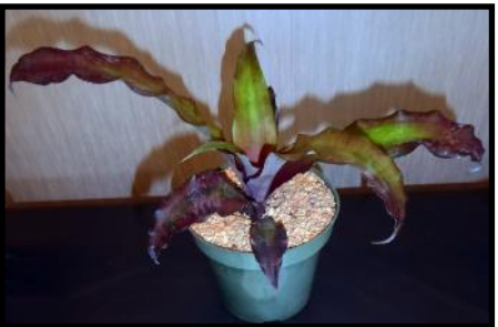
Cryptanthus bivittatus 'Ruby' (B) Exhibitor: Patricia Buenaventura

Cryptanthus argyrophyllus (B) Exhibitor: Patricia Buenaventura