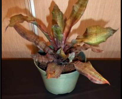
Cryptanthus Ruby Port (AM) Exhibitor: Gordon Stowe