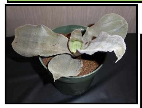
Cryptanthus bahianus Clone B (B) Exhibitor: Gordon Stowe