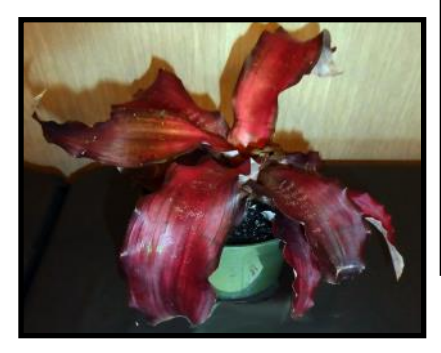
Cryptanthus Mars (AM) Exhibitor: Ed Edmiston