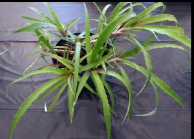
Cryptanthus Circuit Breaker (B) Exhibitor: Gordon Stowe Cryptanthus Earth Angel (B)