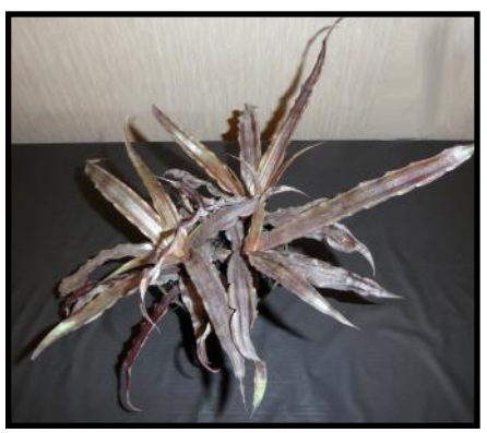
Cryptanthus Terry's Wild Heart (AM) Exhibitor: Ed Edmiston