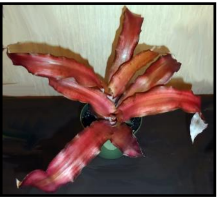
Cryptanthus Burgundy Blast (B) Exhibitor: Ed Edmiston