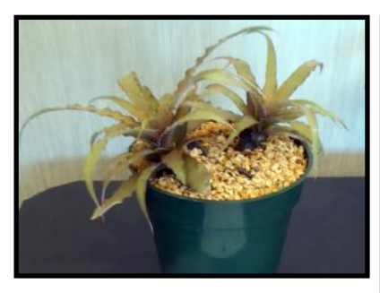
Cryptanthus acaulis (B) Exhibitor: Patricia Buenaventura