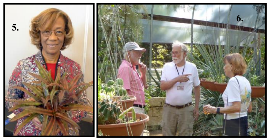
Cryptanthus Society Journal Vol. XXXVIII No. 4 Oct-Dec 2023