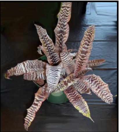
Cryptanthus Strawberries Flambe (AM)