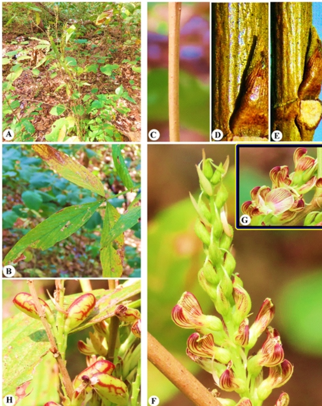
Figure 2: Flemingia praecox var. robusta A. Habitat, B. Leaf, C, D & E. Stem, F & G. Inflorescence, H. Infructescence.

hairy; Calyx 0.8–12 mm long, hairy, gland dotted; campanulate, hairy. Corolla pale yellow with bluish striations; standard 1 × 1.44 cm long, rounded, apex blunt, glabrous, clawed with 2 auricles; claw 1–1.5 mm long, auricled; auricles 1 mm or less than 1 mm; wing petals 6–6.5 × 1.5–2 mm, oblong, falcate; claw 2–2.2 mm long; black with purple striations; pubescent, keel petals 2–6 mm long; boat shaped, fused at apex at lower side; claw 1.8–2 mm long. Stamens 10, diadelphous (9+1); staminal tube