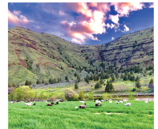
Sage River Ranch

Go to TravelOregon.com and RideOregonRide.com for scenic byway and scenic bikeway information.