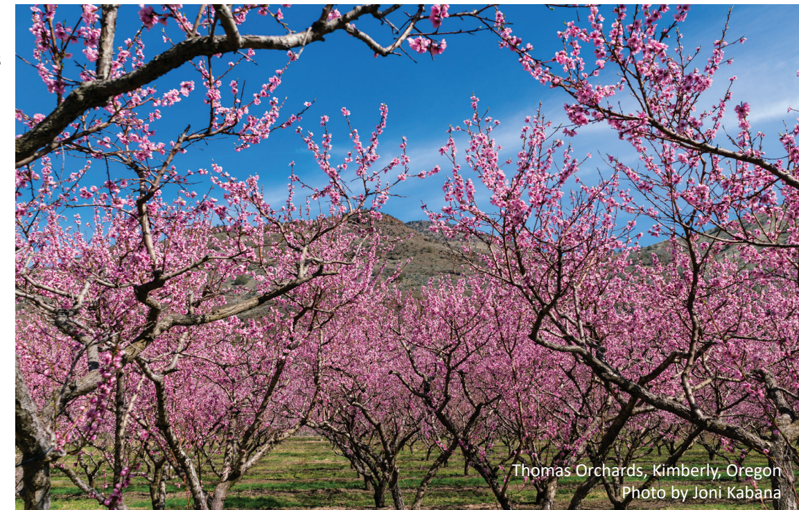
Thomas Orchards, Kimberly, Oregon