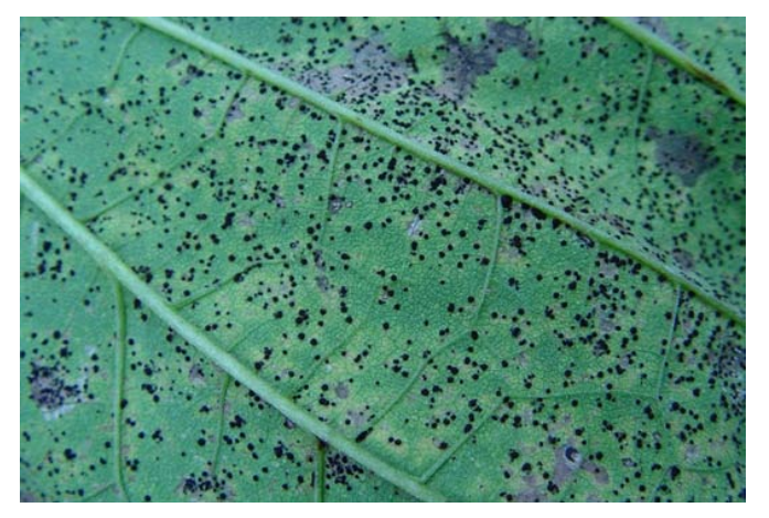
Figure 1. Black-colored common rust pustules on the underside of a sunflower leaf in the later part of the growing season. This is the most common location and time of infection.

Common rust is native to North America and is characterized by cinnamon-red colored pustules on the leaves or other plant parts (Figure 1). One foolproof way to identify rust from other leaf diseases is to physically rub the pustules with thumb and forefinger. This causes common rust to smear, similar to iron rust. Rust thrives in warm and humid environments with typical infection occurring during the mid to late summer months. Extended dewy conditions highly favor rust formation.