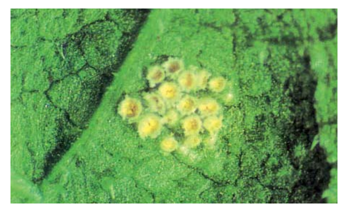
Figure 2. Aecial cups – an early season stage that indicates the onset of common rust infestation.

Confection type hybrids are generally more susceptible to rust (and other diseases) when compared to oil types and should be managed accordingly.