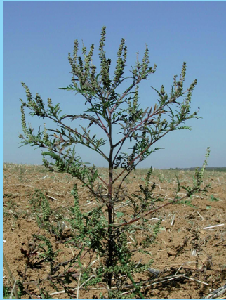
Ambrosia artemisiifolia L.