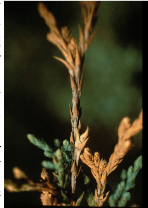
Figure 1. Phomopsis twig blight on juniper shoot. Note pycnidia of Phomopsis fungus on stem.

Juniper seedlings and transplants in nurseries are highly susceptible and are commonly killed by the blight. Overhead irrigation in a nursery is conducive to infection, and a large number of seedlings, transplants, or grafts can be blighted and killed in a very short time. The value of older nursery stock diminishes markedly from infection and the survival of this stock is poor after planting. The disease becomes progressively less serious as trees and shrubs grow older, even though the new growth of older plants is very susceptible, death or severe damage to a plant over five years old is much less likely.