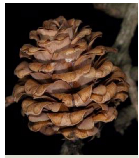
Figure 4 A female Japanese larch cone with reflexed scales.

Deciduous trees also produce cones. For example, dawn redwood ( Metasequoia glyptostroboides) is a large conifer, ranging from 70 to 100 feet-tall, that that bears solitary, small cones and sheds it reddish-brown leaves in the fall. The Missouri Botanical Garden has more than 20 of these stately trees that were planted as seedlings in 1952. Larch is another type of deciduous conifer. Although found mostly in the northern United States, Japanese larch ( Larix kaempferi ) trees produce small cones with scales that are reflexed at maturity ( Figure 4 ). Cones mature in October, but persist on the tree until seeds are dispersed. Bald cypress ( Taxodium distichum ) is acone-bearing, deciduous tree