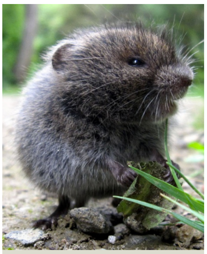
Figure 1 A meadow vole, commonly found in or near tall vegetation in northern Missouri.

For small populations of voles, mouse snap traps baited with a slice of apple or peanut butter and oatmeal can be used. Also, stake the trap down as voles can sometimes drag them away. With some excavation, traps can be placed end-to-end or perpendicular inside runs. Repellents are also available, but often these products wash away with precipitation and do not