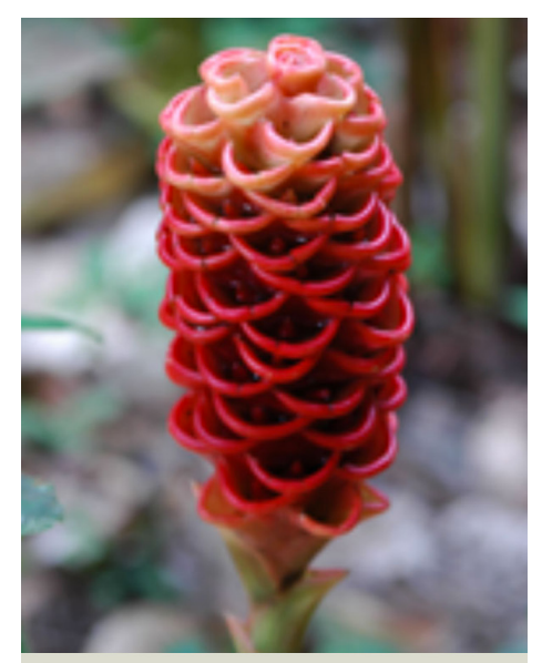
Figure 6 A red strobilus on a beehive ginger plant.