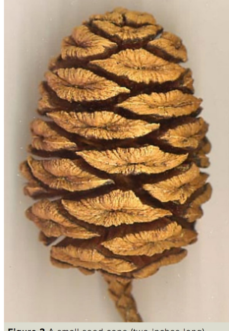
Figure 3 A small seed cone (two-inches-long) from a giant sequoia tree.

of California and can produce over 11,000 small cones on a large tree at a time, dispersing up to 400,000 seeds per year ( Figure 3 ).