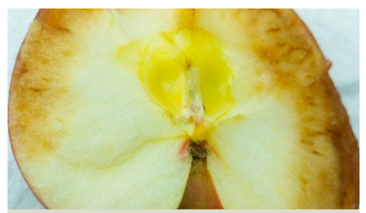
Figure 3 Apple fruit showing senescent breakdown after storage.

Senescent breakdown , another apple disorder that can cause fruit loss during storage, is most prevalent in apples harvested late and stored for long periods. Symptoms on the skin appear as brown patches while the interior of the fruit develop brown flesh and internal breakdown ( Figure 3 ). Strategies that delay the occurrence of senescent breakdown include harvesting fruits at the right maturity stage, and using an optimum temperature in cold storage.