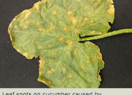
Leaf spots on cucumber caused by Colletotrichum orbiculare

Anthracnose is a widely distributed fungal disease of cucurbits. The MU Plant Diagnostic clinic received a sample of cucumber with leaf spots caused by the fungus Colletotrichum orbiculare (syn. Colletotrichum lagenarium ). Anthracnose can cause serious losses of cucumbers, melon, watermelon and muskmelon whenever susceptible cultivars are grown but rarely infects pumpkin and squash. Warm, humid, and frequent rain favors disease development and spread. Infection can occur on seedlings, leaves, petioles, stems, and fruits.