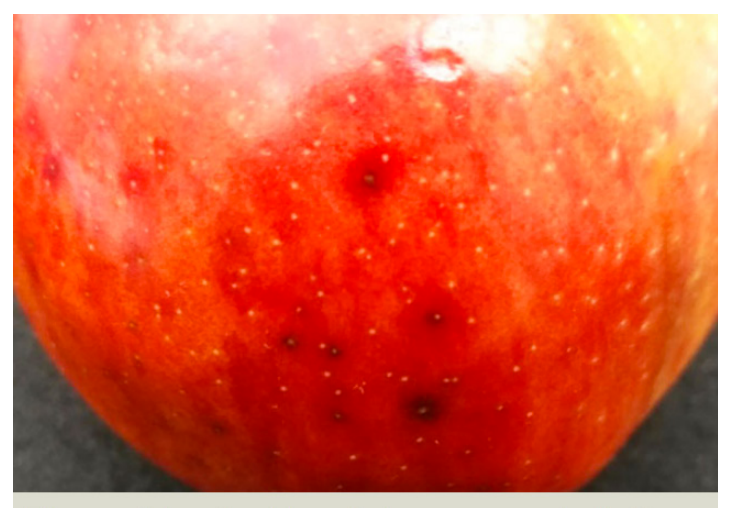
Figure 2 Lenticel breakdown on apple fruit.

Lenticel breakdown is a physiological disorder most often observed in stored apples. Symptom of lenticel breakdown can be inconspicuous at harvest but may become evident within few days of packing. Initial symptoms develop as small spots over the lenticel on apple skin ( Figure 2 ). As the fruit firmness decreases in storage, these spots enlarge, become sunken, and turn dark brown. Unlike bitter pit, lenticel breakdown appears only on the skin with no corking of the flesh. Mineral imbalance, late fruit harvest, and longer fruit storage are conditions that can increase susceptibility of apple fruit to lenticel breakdown. There is limited information on the management of lenticel breakdown in apples.