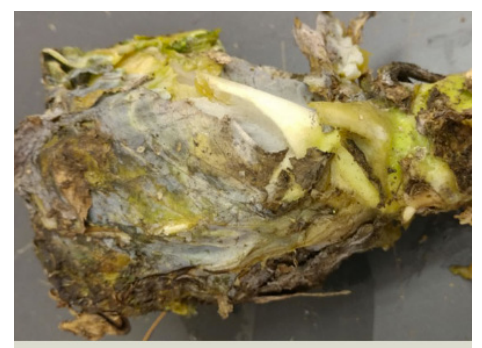
Soft rot on cabbage caused by Pectobacterium carotovorum subsp. Carotovorum

The following are highlights about samples and disease issues diagnosed at the Plant Diagnostic Clinic in the month of September.