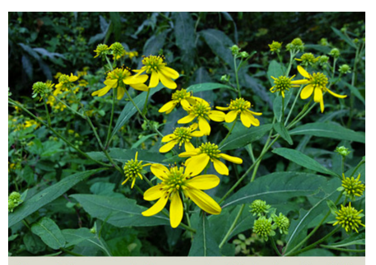
Figure 2 A common herbaceous plant, Verbesina alternifolia, onwhich spectacular, but elusive, ice flowers can form.