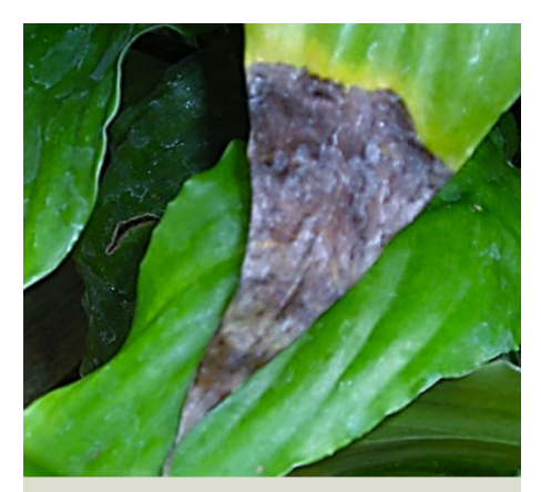
fluoride damage on a peace lily

Even with the best conditions, recover of damaged plants may be slow. If the damage was severe, it may require the longer days and improved growing conditions of spring and summer to bring a plant back to its past state of attractiveness.