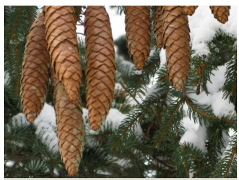
Figure 1 Female cones at branch tips of a Norway spruce tree.

True pine cones are abundant as there are about 115 different species that are native to most temperate and subtropical regions of the world. Most pines produce small male cones (0.4 to 2 inches-long) in the spring, but after their pollen is shed, they soon drop. Fertilization occurs a year later with female cones maturing 1.5 to 3 years after pollination. The sugar pine (Pinus lambertiana ) produces the longest seed cone (up to 25 inches) of any conifers and is the tallest of the pines, reaching 269 feet. Champion sugar pine trees can be found in Yosemite National Park and Umpqua or Siskyou National Forests. Closer to Missouri, Scotch pine (P. sylvestris) seed cones are usually up to 3 inches long and may be found on trees sold as Christmas trees. Other cone-bearing species, such as Eastern white pine (P. strobus), limber pine (P. flexilis), and Japanese red pine (P. densiflora), are recommended for planting in Missouri. Because Austrian pine (P. nigra) is susceptible to Diplodia tip blight and Scotch pine often suffers from pine wilt fungus and nematodes, these trees are not recommended for planting.