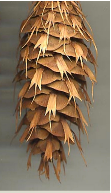
Figure 2 A Douglas-fir seed cone with two types of bracts.

The cones of fir trees ( Abies sp.) vary widely among species. Seed cones of fir trees can range from very small (1.5 inches-long) on Frasier fir ( A. fraseri ) to large (10 incheslong) on noble fir ( A. procera ). White fir ( A.