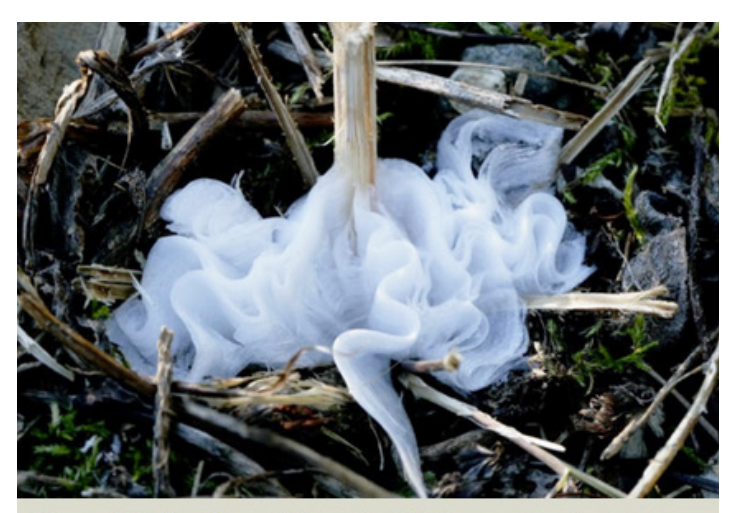
Figure 1 An "ice flower" formed at the base of a plant stem.

Other types of ice formation occur on rocks and soil. Needle ice occurs on silty to clay-type soils with optimum porosity. Rods of ice, known as pebble ice, can form on porous sedimentary rocks that are contact with moist soil. Some types of pottery and brick are also known to form pebble ice. Both needle and pebble ice can increase in size over successive nights when sub-freezing temperatures occur. For more images of ice formation on rocks, soils, and plants, see https://www.americanscientist.org/article/ flowers-and-ribbons-of-ice.