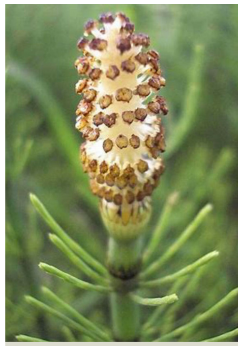
Figure 7 A strobilus on a field horsetail plant.