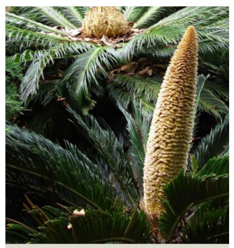
Figure 5 The rounded female cone and the elongated male cone on sago palm plants.

While these are just a few of the conebearing plants, there are many others. So no matter what time of year, you can find plants that bear fascinating cones!