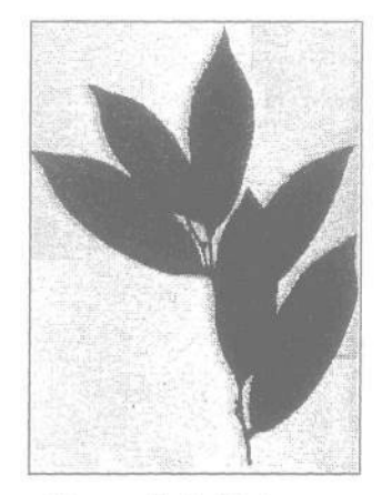
Figure 5.3: Meiogyne monosperma