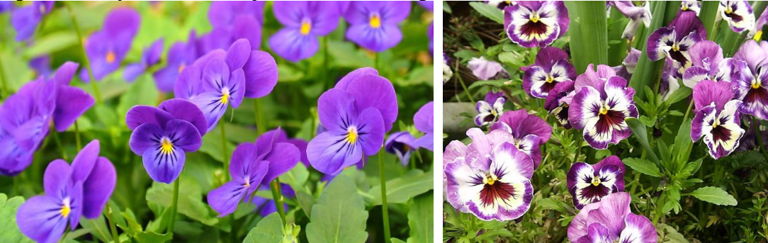
Figure 1. Pansy cultivar with species Viola markings (left) and dark central faces (right)