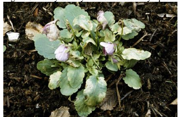
Figure 3. Pansy downy mildew disease symptoms

The symptoms of pansy downy mildew include brown-purple spots on the upper leaf surfaces, sometimes with a surrounding yellow halo of chlorotic discoloration. Sporulation of P. megasperma can be seen in the underside of leaves. The margins of severely affected leaves may curl under, become necrotic and eventually die. Severe infections lead to stunting and reduction in the number of flowers [8,9].