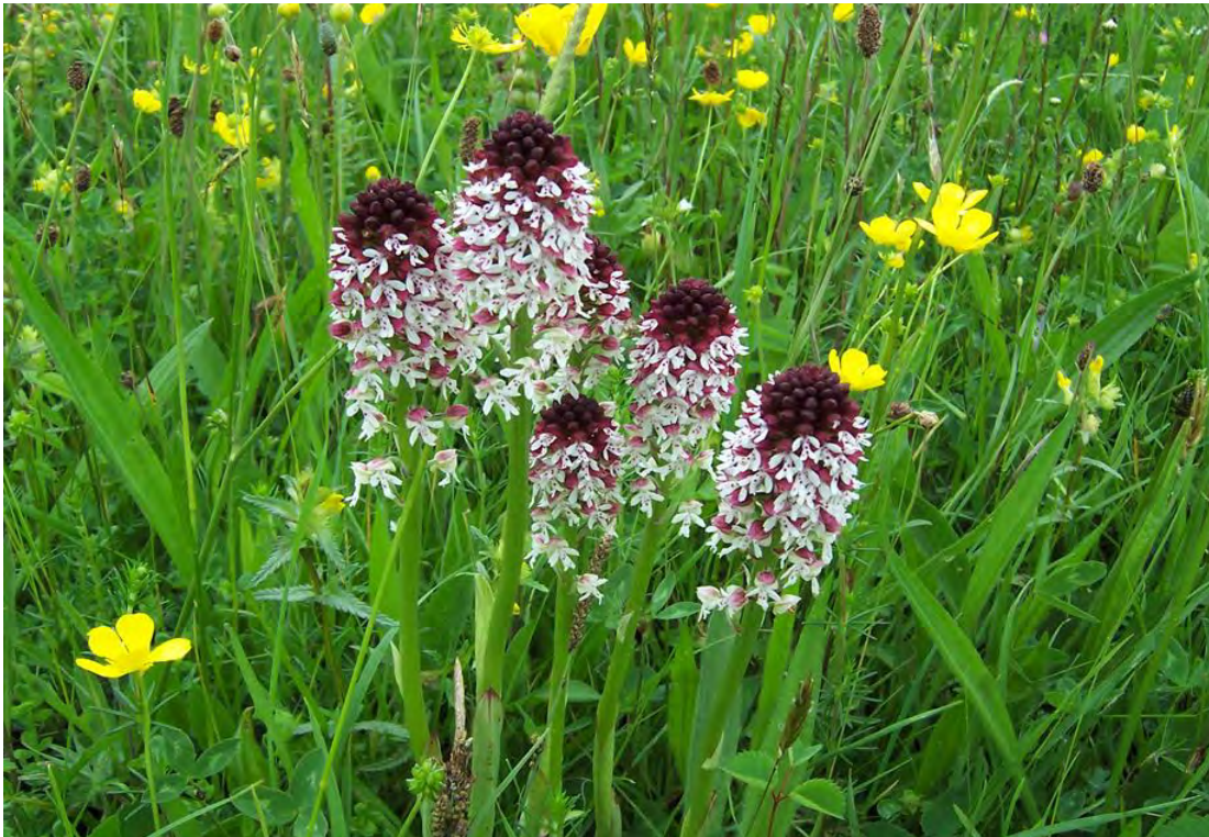
Neotinea ustulata Burnt Orchid at Clattinger Farm