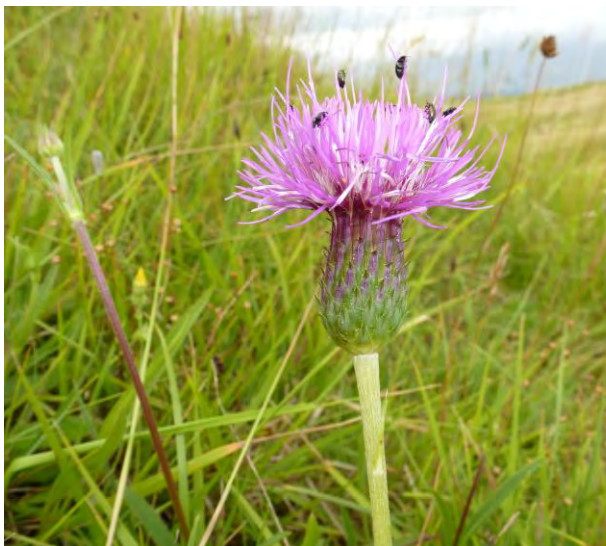
Cirsium x medium