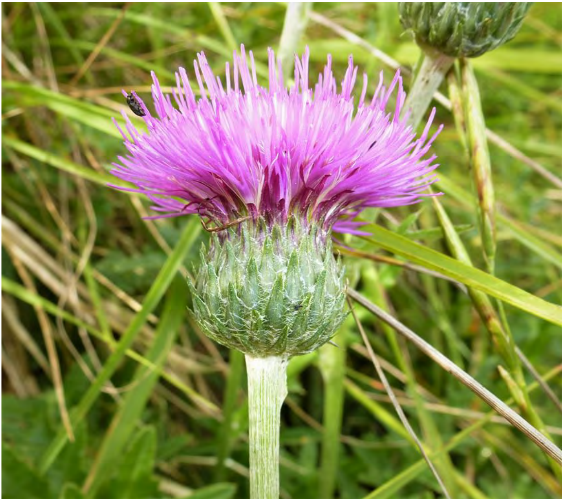
Cirsium tuberosum Tuberous Thistle at Oliver's Castle