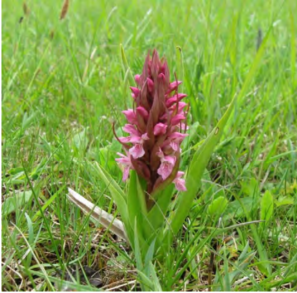
Dactylorhiza incarnata ssp. incarnata