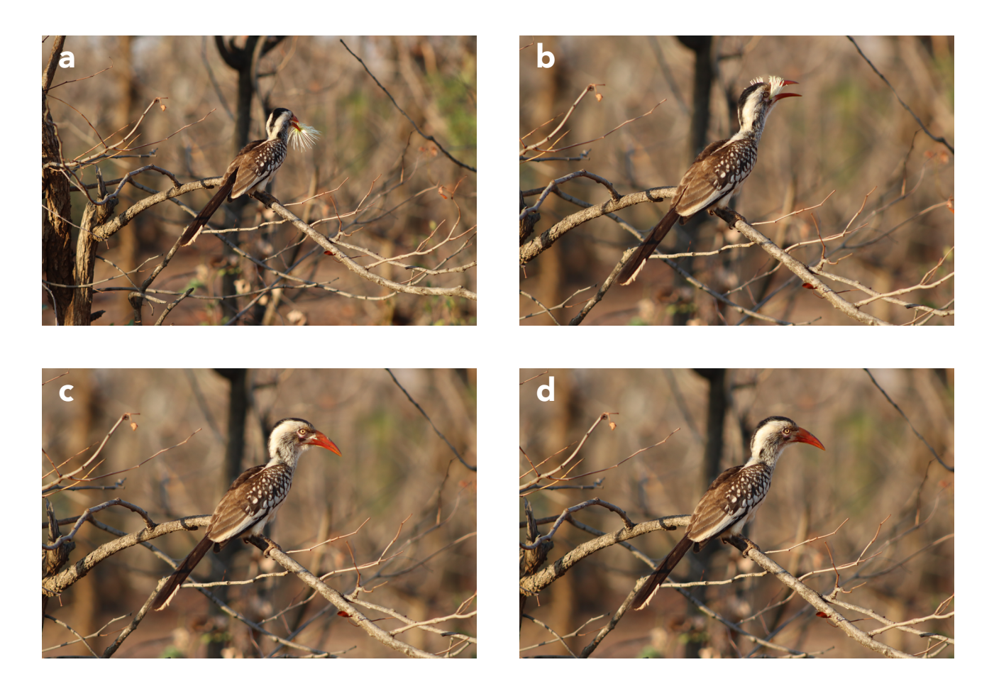
Southern Red-billed Hornbill consumption of a Thilachium africanum flower: the whole sequence took a few seconds. The first photograph is of the bird with the whole flower in the beak (a), next the swallowing begins (b) and the third shows just a few last stamens protruding (c). The final photograph is "satisfaction" (d). This individual was seen outside the gate of the Sereni.

(Santhoshkumar and Balasubramanian, 2014) and Oriental Pied Hornbills Anthracoceros albirostris (https://besgroup.org/2015/11/30/oriental-pied-hornbill-takes-a-flower-bud/). When the literature on flower-feeding observations for the Indian Grey Hornbill was consulted we discovered that these were in the non-breeding season and comprised 0.5% of the feeding observations (~16 out of 3,086) and comprised petals of an unidentified flower. We did not find any reference to flower feeding of the Oriental Pied Hornbill but did find a seemingly single observation of flower feeding by the Great Hornbill Buceros bicornis, with a photograph of it taking a bud from Delonix regia (better known in South Africa as the Flamboyant - a common street tree