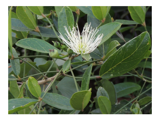
Thilachium africanum is an evergreen woody shrub or small tree with a heavy canopy growing to ~4 m. The flowers are large, without petals, and with many white stamens. Characteristically the leaves are mostly trifoliolate, stiff with a sharply pointed apex.

Flower consumption is rarely reported in hornbills. In Asia, flower consumption has only been reported for the Indian Grey Ocyceros birostris