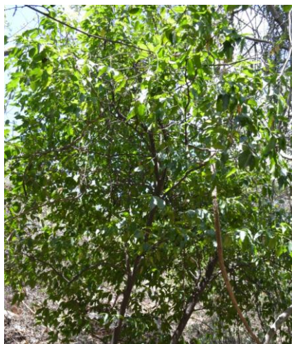
Fig. 1 Habit of Miliusa eriocarpa

and made into herbarium following Jain and Rao (1977). The herbarium specimens were critically examined with help of standard floras and appropriate websites. The voucher specimens are deposited at Herbarium of department of Botany, Sri Krishnadevaraya University, Anantapuram (SKU).