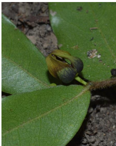
Fig. 2 Flower of M. eriocarpa