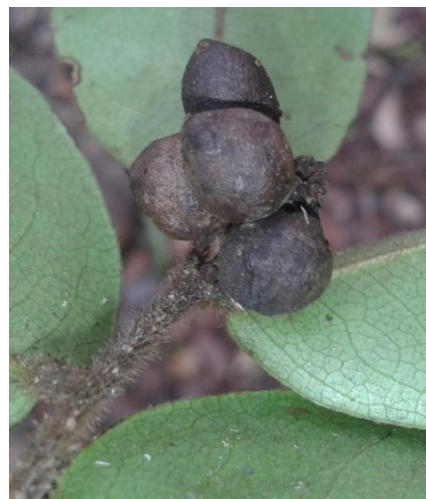
Fig. 3 Fruiting of M. eriocarpa