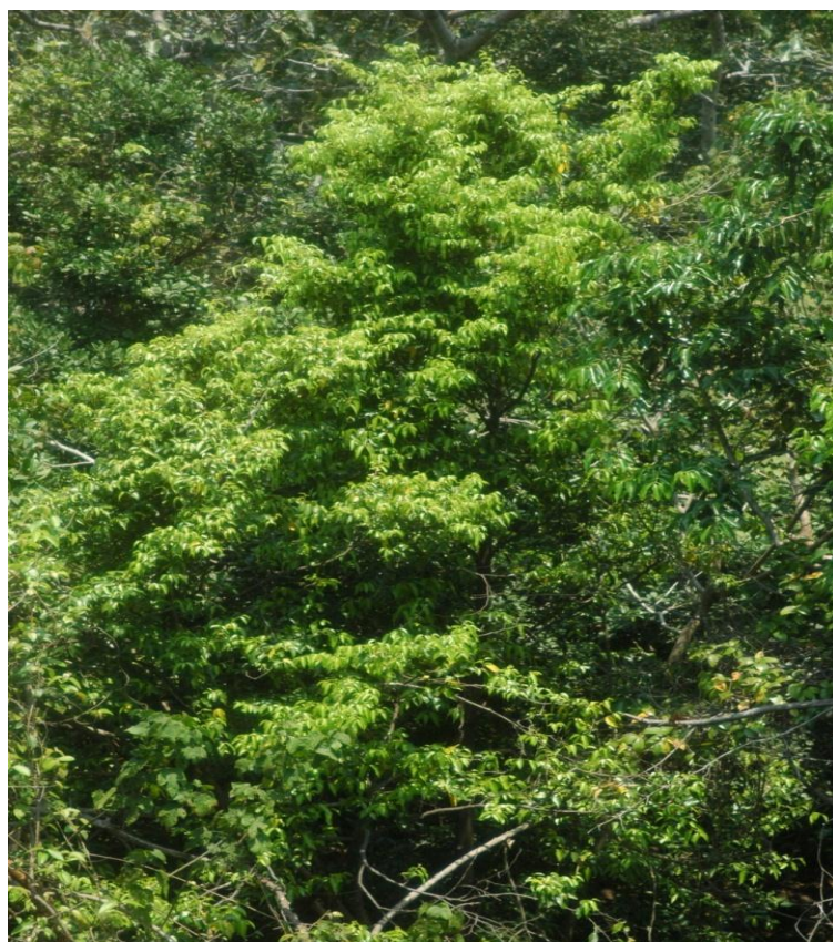
Fig. 4 Habit of Mitrephora heyneana