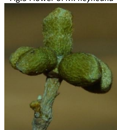
Fig. 6 Fruiting of M. heyneana