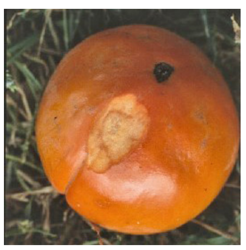
Figure 17. Anthracnose on persimmon fruit.