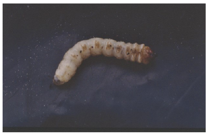
Figure 13. Tree borer of persimmon.