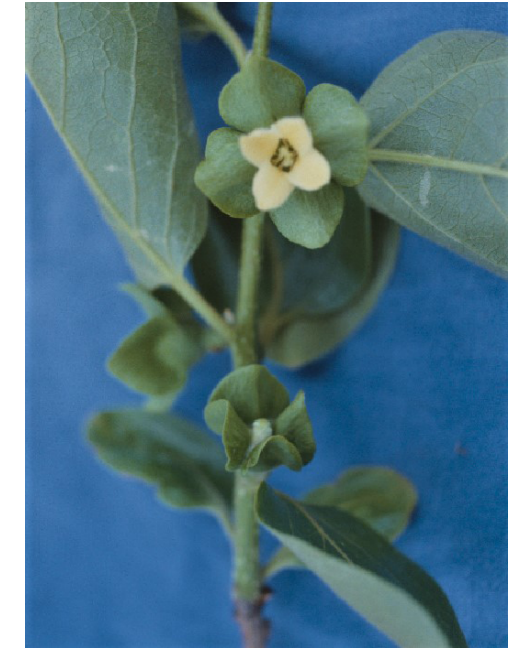
Figure 4. Female persimmon flower.

level, because persimmons tend toward biennial bearing if fruit load is high. Mature trees of smaller-fruited cultivars may reasonably support 250–300 fruit per tree at maturity, whereas larger-fruited cultivars could handle 150–200 fruit per tree. Trees will begin bearing fruit by the third year, with 8–10 years required for full production. Recent production data from 2013–2014 in California shows the average persimmon yield is 5.4 tons per acre. Estimates of production in south Florida are in the 3.6–5.4 tons per acre range, and north Florida is likely on the higher end. Yields are generally lower for the nonastringent varieties.