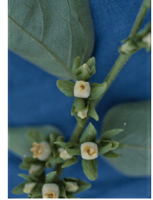
Figure 5. Male persimmon flowers.