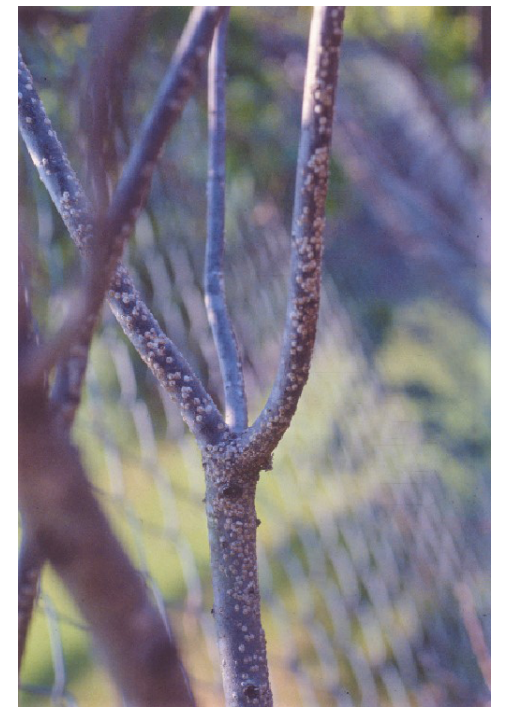
Figure 9. Scale on persimmon.