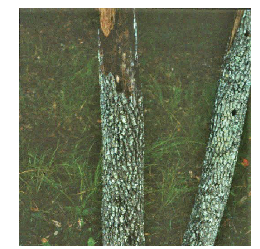
Figure 22. Cephalosporium damage on persimmon trunk.