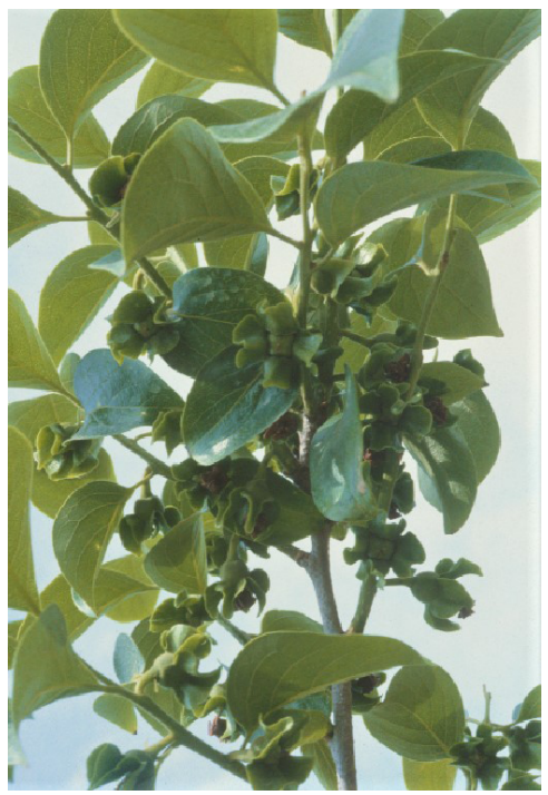
Figure 6. Persimmon shoots with flowers.