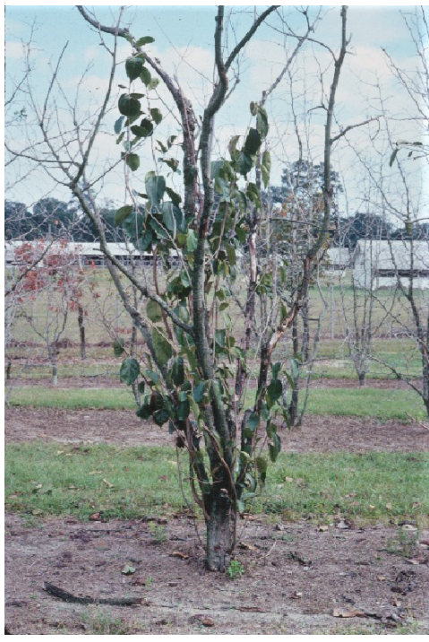
Figure 8. Freeze damage and regrowth from dormant buds.