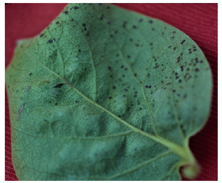
Figure 19. Persimmon leaf spotting.