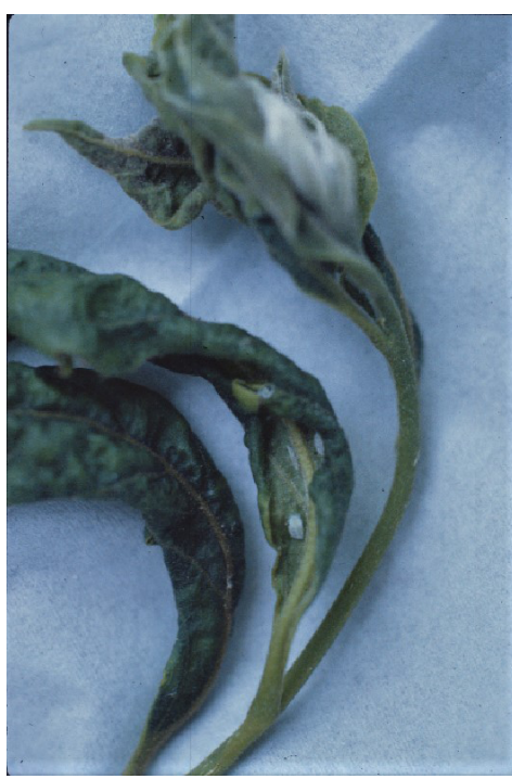
Figure 12. Psylla nymphs on distorted leaves.