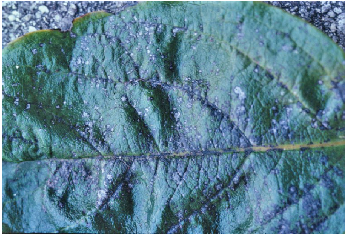
Figure 20. Phyllosticta spotting on persimmon leaf.