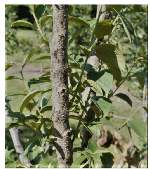
Figure 24. Persimmon decline canker on the trunk.