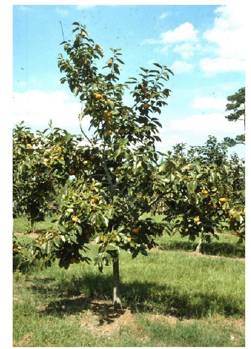
Figure 3. Modified central leader system.

laterals every 8–12 inches to keep. The goal is to have 4–6 well-spaced branches radiating from the trunk. Once this is achieved, the central leader is then "modified" by cutting it back to the final lateral branch, which will limit significant height increases in the future (Figure 3).