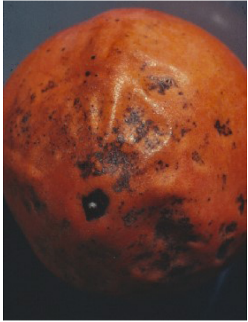
Figure 16. Fruit spotting on persimmon.