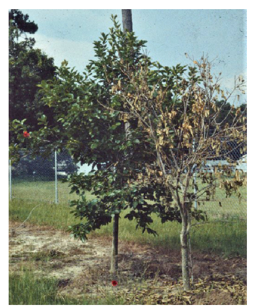
Figure 23. Whole persimmon tree decline.