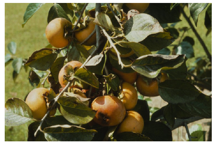
Figure 7. Very heavy crop load, unthinned.

Thinning persimmon fruit is often needed to regulate the crop load (Figure 7) and to help limit the alternate bearing tendency. Some regulation of crop load can be made through judicious pruning during the winter. Most flower buds will grow from the few end buds on a branch tip. By leaving some of these unpruned, some tipped a bud or two, and other weak branches pruned back further, less thinning of fruit is required. Hand thinning is done just after the first natural fruit drop, or about 3 weeks after flowering. Fruit should be spaced 6 inches apart on a branch to prevent rubbing damage to adjacent fruit. Remove any deformed or damaged fruit, and leave the fruit with the largest calyxes for the best fruit quality at harvest.