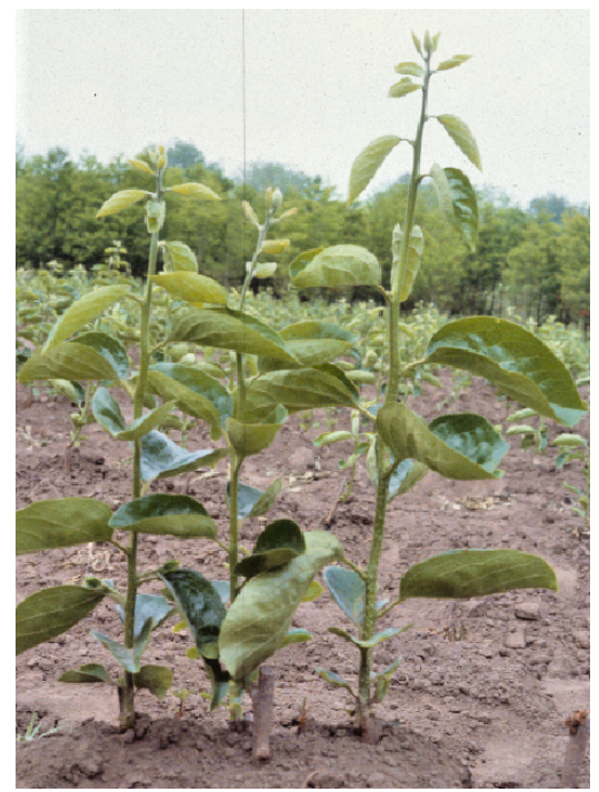
Figure 1. Chip-budded trees. Credits: UF/IFAS

orchard but is typically performed on much older trees. If rootstocks are available, but scion bud wood happens to be limited, one temporary strategy would be to establish the rootstock in the field, and to bud or graft the scion in situ when material is available.