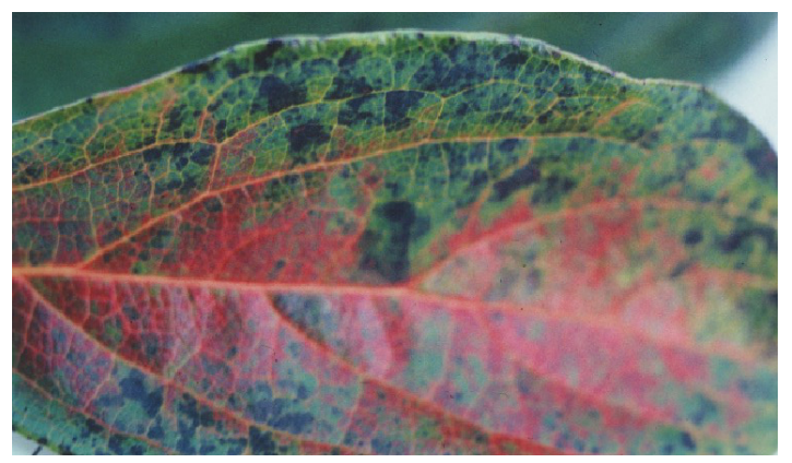
Figure 21. Alternaria spotting on persimmon leaf.