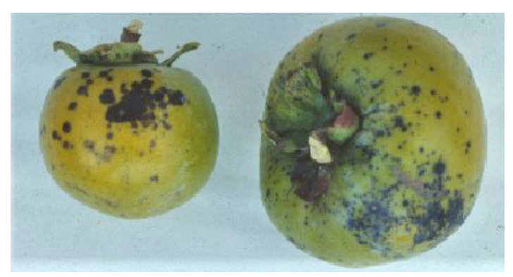
Figure 18. Anthracnose on persimmon fruit.