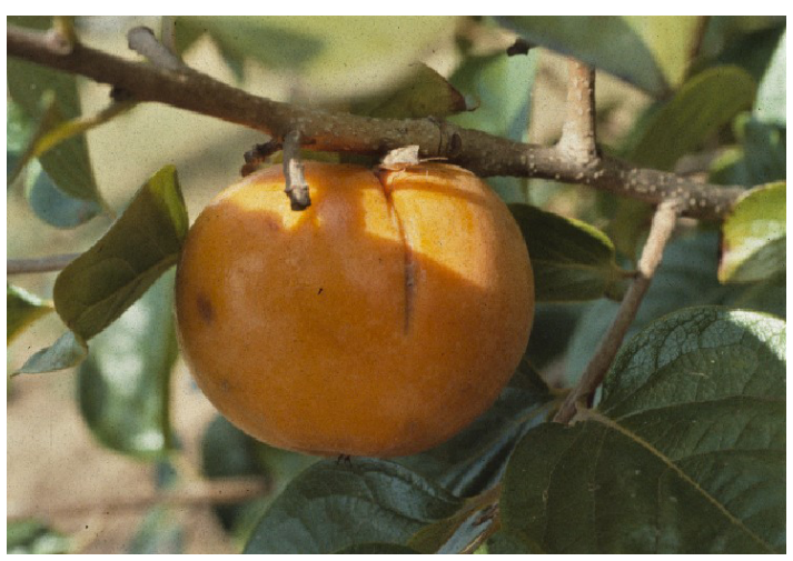
Figure 15. Stink bug on persimmon fruit.