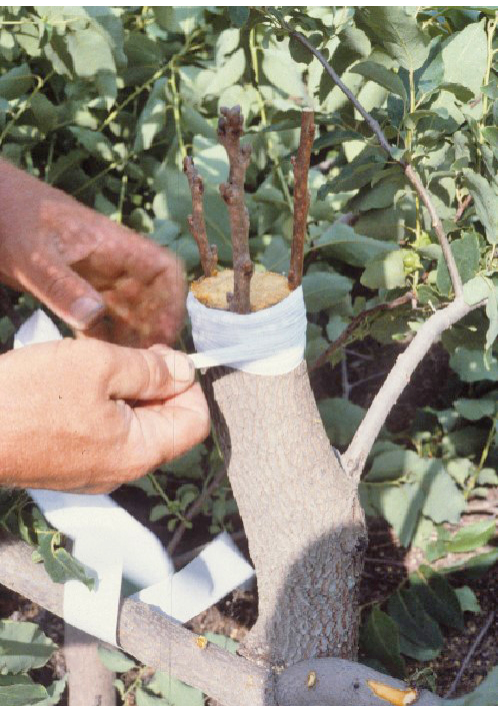
Figure 2. Top-grafting scions.