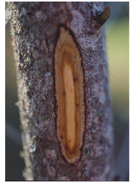
Figure 10. Damage from scale under the bark.