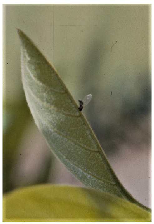
Figure 11. Adult persimmon psylla on leaf.