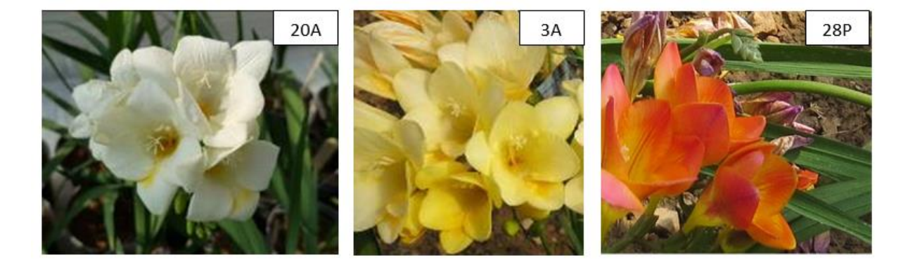
Fig. 2. Offspring plants of crossing and self-pollination