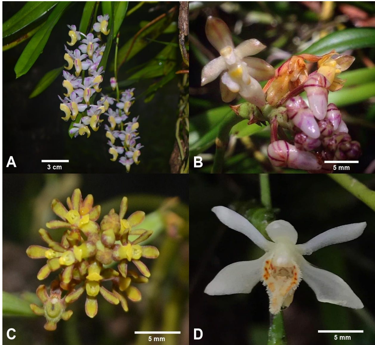
Figure 3: Newly recorded orchid species found in the disturbed forests of Kelantan: A , Aerides odorata ; B , Micropera pallida ; C , Pomatocalpa diffusum ; D , Thrixspermum merapohense .