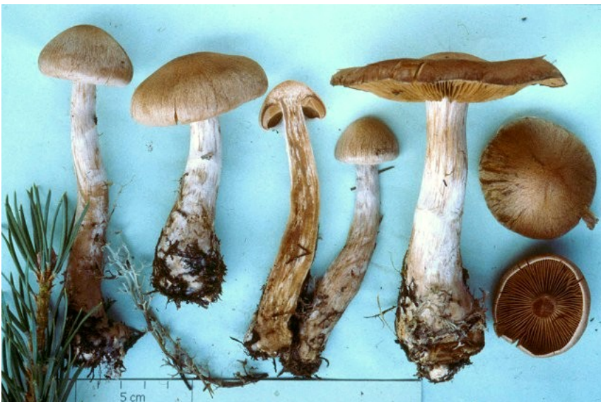
Cortinarius brunneogriseus Soop sp. nov., holotype collection