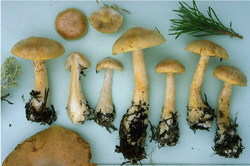
Cortinarius pinophilus Soop sp. nov., holotype collection