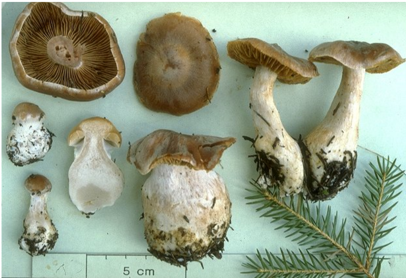
Cortinarius armeniacus Fr. var. badius (Schum.) Soop stat. nov. KS-CO148, Röfors, Västmanland, Sweden