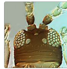
yangtzei head & fore tibiae