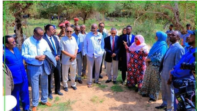
Fig 1. Official Lunch of Geed Deeble Botanical Garden graced by Vice president Hon. Abdirahan Ismail Saylici

Botanical garden is a garden purposively selected for the conservation of biodiversity and with the aim of multiples use both at community, academia and for global benefits. Botanical gardens known to be located around the globe with many efforts put to increase the numbers in all the continents. The garden contains a collection of living organisms and range from both Fauna and flora coexisting within the ecosystem established. The garden is often used as common gardens for community, and also serving the researchers with interest in understanding the ecosystems as well as supporting the establishment, management decision making and protection. The Botanical garden serve as a critical conservation site for many regions of the world, protecting critical biodiversity.