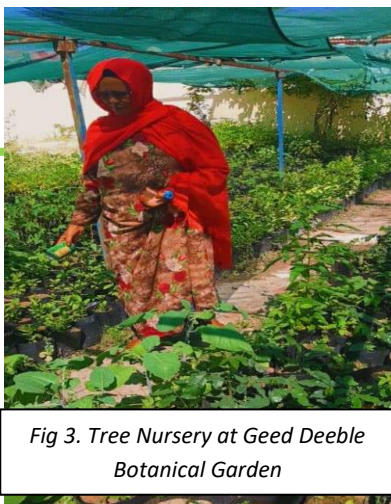
Fig 3. Tree Nursery at Geed Deeble Botanical Garden

From the lessons from all over the world's Botanical gardens, they are known to attract a large number of visitors and volunteers, with the expected learning platform created, increased awareness on conservation efforts and biodiversity protection, has a wider spillover effect to help make the world landscape a better place to live. The support for research is also a valuable role played by the Botanical gardens of the world. The Gardens have also contributed to promising future directions for research and public engagement in solving societal problems. The botanical gardens have indeed advanced climate change research, often through the use of new or improved tools that allow researchers to leverage the living, historical, and specimen collections of botanical gardens. At the same time, new scientific, conservation, and public engagement challenges have arisen that botanical gardens are uniquely positioned to address. This has been emphasized in the published review 'New Phytologist Tansley' (Primack & Miller-Rushing, 2009), which highlighted on the underutilized capacity of botanical gardens – gardens that specialize in the display, scientific study, and utilization of plant diversity – to advance climate change research. In the decade since.