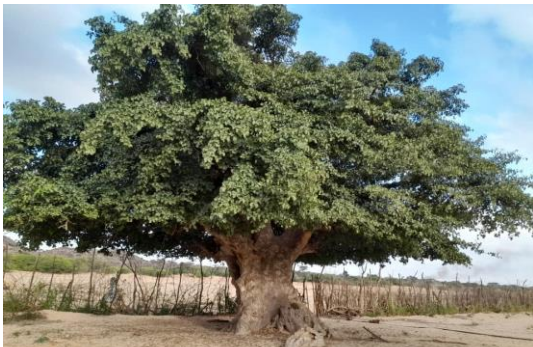
Fig 2. Fig Tree at Geed Deeble Botanical Garden

Botanical Gardens have been documented to have crucial roles in growing the economy, and supporting sustainable development of any country. The Garden is very crucial consideration to Somaliland's economy, where the livelihoods of the people depends on natural resources, mainly on trees, shrubs, grasses, herbs, etc., which are critical Biodiversity that should be protected. It is well documented that, we can't protect, conserve and sustainably manage what we don't know, its value and impacts to the economy both at household and the nation at large. Many plants in Somaliland are faced with threats of extinction, including the valuable trees producing gum and resins ( Boswellia spp) that support over 70% of households incomes in producing areas along the value chain. Other species at threat include Codexia edulis (Yeheb), Acacia manubensis , Acacia flagellaris , Acacia densispina , Dracaena ombet with a wide array of grasses and shrubs that were critical forage resources.