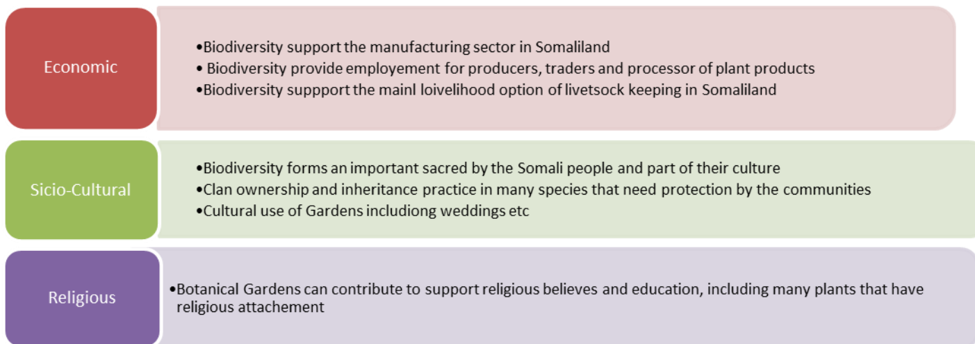
Fig 3. The economic, cultural and religious function of Biodiversity in Botanical Gardens

The establishment of the Botanical garden in Somaliland is expected to support the economy of the country by creating employment, support investments and savings, support research and education, as well as increase the Government role in conservation efforts of critical biodiversity. Below is examples of support services that Biodiversity offers.