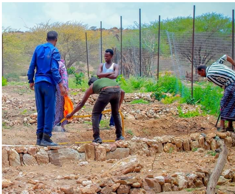
Fig 2. Community engagement on land preparation for the establishment of Geedka Deeble Botanical Garden

The need for engagement at all spheres in the efforts to combat climate change impacts is real. The world over, we know that biodiversity loss is one of the major impacts of climate change phenomena. The establishment of Botanical gardens provide the opportunity to make a contribution in the protection and consideration of critical biodiversity resource that have continued and also have potential for future adaptation to climate change. Botanical gardens provided researchers and practitioners with an opportunity to contribute to development of solutions and innovations that biodiversity offers in addressing climate change. The gardens offer the opportunity to conserve and protect the unique resources, including diverse collections of plant species growing in natural conditions. The gardens also offer opportunity to have a pool of historical records that will help plan for the future. The gardens with the provided experts in various fields have a role in educating the masses from the set up gardens on what options are available, which species and why for adapting and mitigating the climate change impacts, including the much need knowledge on choice of species and practices by the communities.