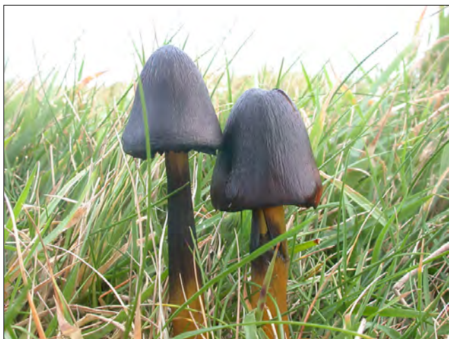
Plate 21: Hygrocybe conica . The Airfield. November 2004. \times 1.5