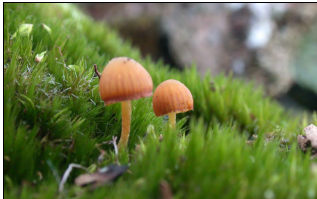
Plate 12: Galerina hypnorum . In moss on the edge of the path to the Battery. November 2004. x3