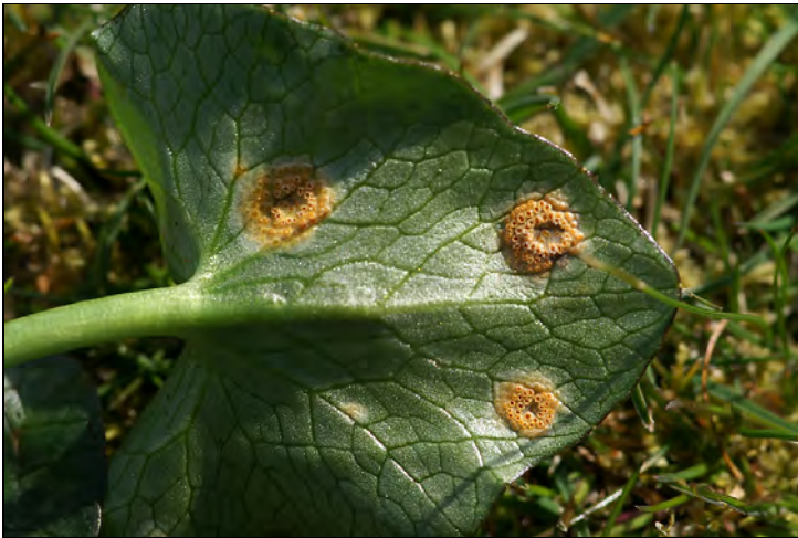
Plate 14: Uromyces dactylidis , Aecidia on Ranunculus ficaria (celandine). Upper Millcombe Valley. April 2005. \times 3