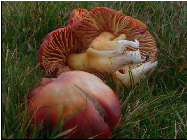
Plate 19: Hygrocybe splendidissima . The Airfield. November 2004. \times 1