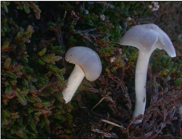
Plate 22: Hygrocybe c.f. radiata . Young fruit bodies. North End. November 2004. \times 1.5

and H. pratensis (Plate 20), (honey coloured). Smaller species included the bright green, later lilac or yellow, H. psittacina , H. conica , (Plate 21), orange-red, blackening with age, and the small white-cream species H. russocoriacea , which smells of leather. However, absence of improvement of the grassland is not the only factor affecting Hygrocybe species distribution on Lundy. In the much more acidic tall grassland north of Quarter Wall and around Pondsburry and just north of Threequarter Wall we found only H. laeta , a pinkish-brown medium-sized species, also found in the short turf areas, but presumably more tolerant of low soil pH. An even more interesting result in November 2004 was the finding of a medium-sized grey species of Hygrocybe fruiting abundantly on the thin peaty soil under the Calluna in the immediate vicinity of the Bronze Age fort at the North End of Lundy. This agaric was never seen in any other location on Lundy and is similar to H. Radiata , (Plate 22), a northern European species and one of the rarest Hygrocybe species in the U.K. (ca. 30 U.K. records in total). A dried specimen of this fungus has been deposited in the mycological herbarium at the Royal Botanic Gardens, Kew and will soon be subjected to critical determination by a specialist.