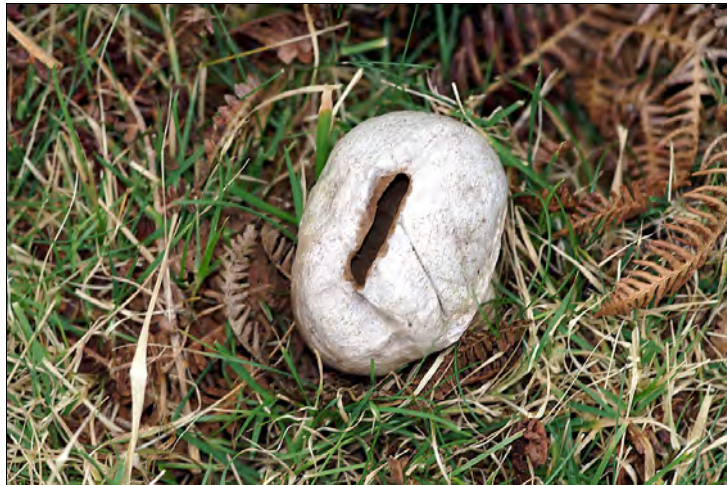
Plate 17: Vascellum depressum . Old fruit body. The Airfield. January 2006. ×1