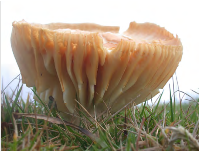
Plate 20: Hygrocybe pratensis . The Airfield. November 2004. \times 1.5