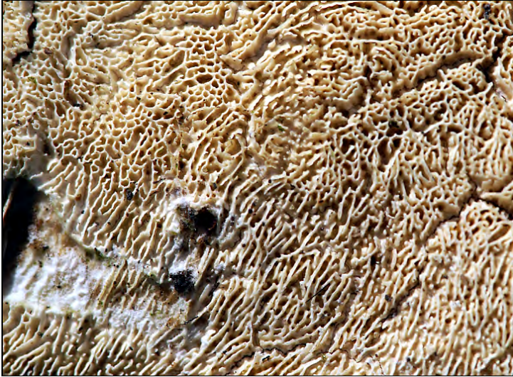
Plate 2: Schizophora paradoxa . Detail of fruit body on the underside of dead rhododendron log, east coast path. April 2005. \times 2.5