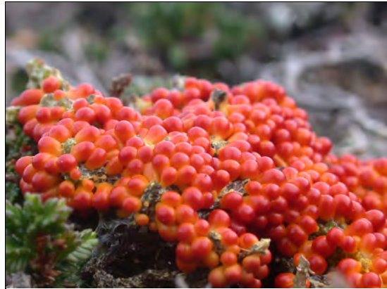
Plate 24: Leocarpus fragilis (Myxomycete) fruiting on Calluna . North End. November 2004. \times 2.5

It could be asked whether a study of fungi on Lundy has any scientific value. Any of the fungi recorded would be likely to be also present on the mainland. However, the account presented in this chapter highlights a number of counter arguments. Firstly the national conservation status of Lundy means that a complete inventory of the organisms present is highly desirable, and although the lichens, part fungus, part alga, have been previously well