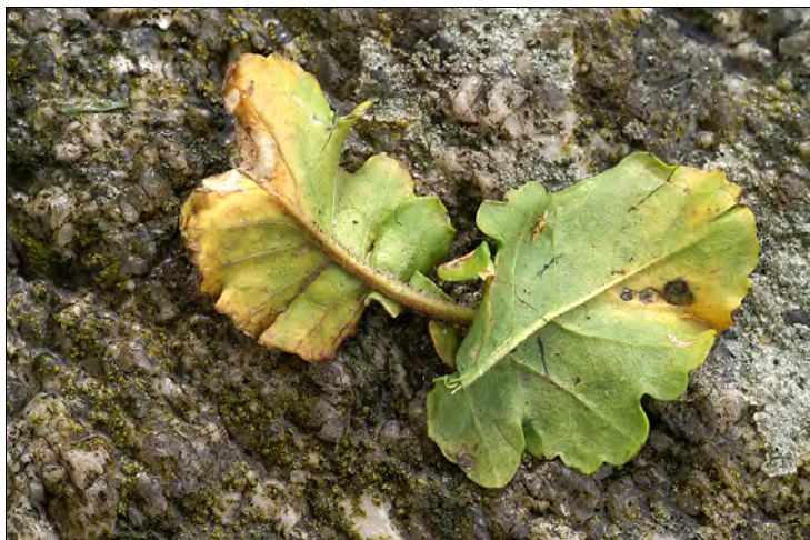
Plate 15: Possible Mycosphaerella sp. On Coincya wrightii (Lundy cabbage). Beach Road. April 2005. \times 1.25