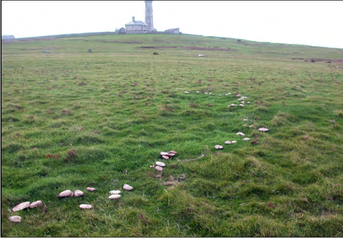
Plate 16: Ring of Lepista nuda (wood blewitt) near the Airfield. November 2004.