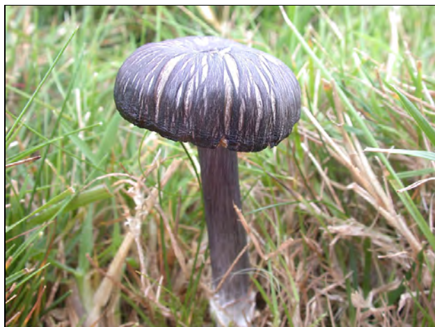
Plate 23: Entoloma ( lampropus group). The Airfield. November 2004. \times 2