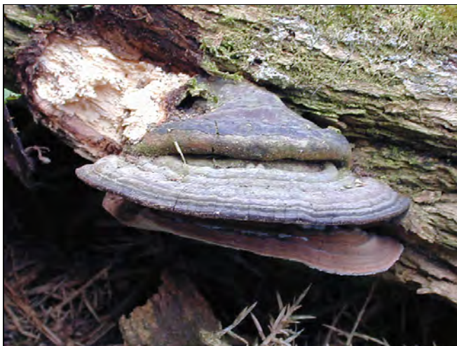
Plate 4: Phellinus tuberculatus on dead gorse, behind Brambles. October 2003. \times 0.5