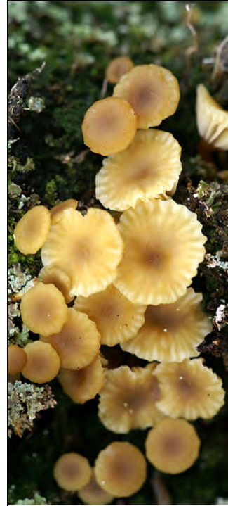
(Right) Plate 10: Omphalina (Gerronema) ericetorum on wet peat. Coast path, Gannets Bay. April 2005. x2