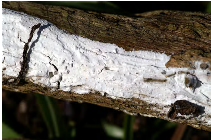
Plate 3: Lyomyces sambuci on dead elder in the Walled Garden, Millcombe Valley. April 2005. \times 1