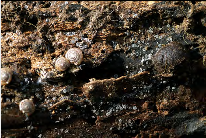
Plate 6: Mollisia cinerea on dead willow in the Quarries. April 2005. \times 1