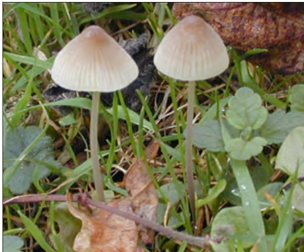
Plate 8: Mycena filopes under willow in the Quarries. October 2003. \times 2

the 'shaggy parasol mushroom', Macrolepiota rhacodes , found in November 2003 fruiting in the nettles by the Castle (Hedger & George, 2004), but probably also present in the Millcombe Valley. This is similar to the 'parasol mushroom', M. procera , widespread in autumn in the grassland around the Old Light, but differs in having a scaly stem and in slow reddening of the flesh of the stem when bruised or cut.