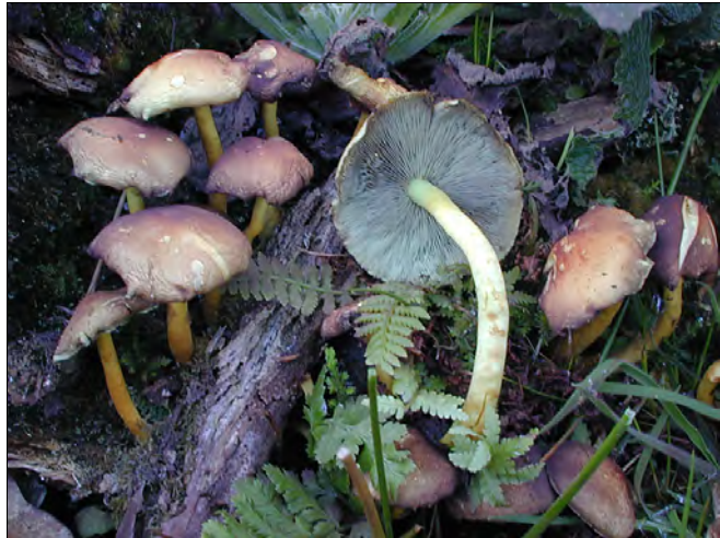
Plate 7: Hypholoma fasciculare (sulphur tuft) on dead rhododendron near The Ugly. October 2003. \times 0.75