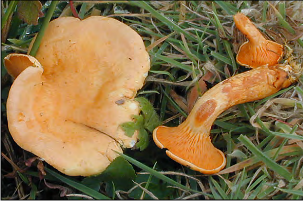
(Above) Plate 9: Hygrophoropsis aurantiaca (false chanterelle) under bracken, near Brazen Ward. October 2003. x1