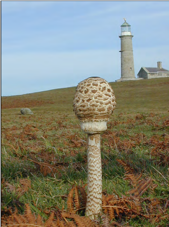
Plate 1: Macrolepiota procera (parasol mushroom) with the Old Light in the background. October 2003.