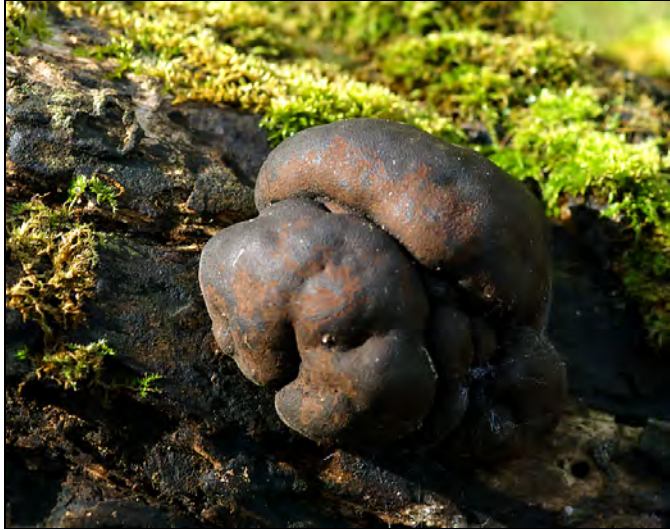
Plate 5: Daldinia concentrica (King Alfred's cakes) on dead ash in Millcombe Valley. April 2005. \times 1