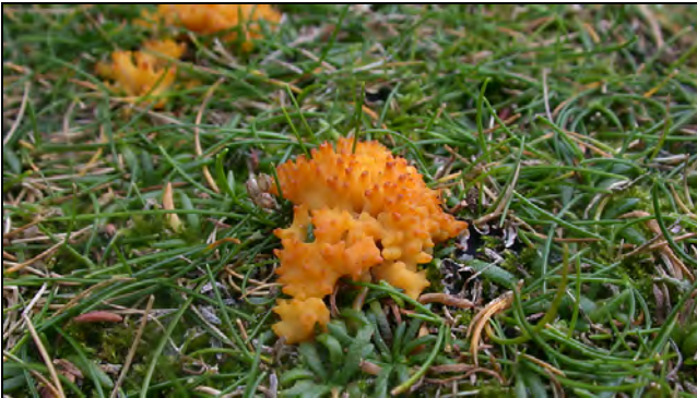
Plate 11: Clavulinopsis corniculata , dwarf form. In Festuca rubra turf near the North Light. November 2004. x1