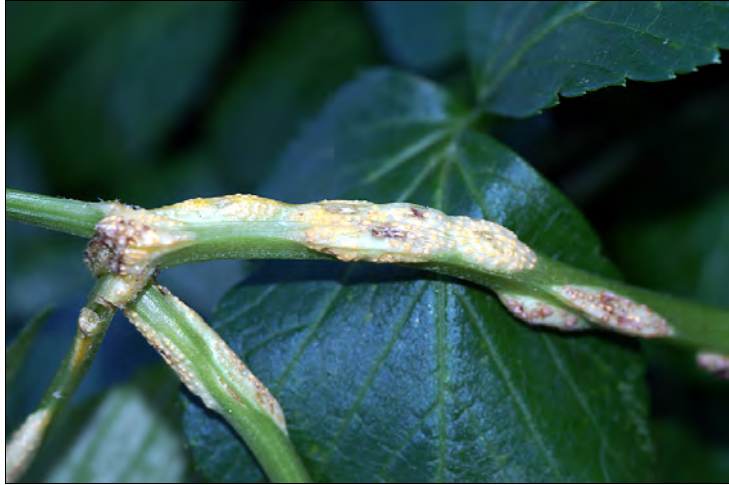
Plate 13: Puccinea smyrniae , Aecidia on Smyrnium olusatrum (alexanders) in Lower Millcombe Valley. January 2006. \times 4