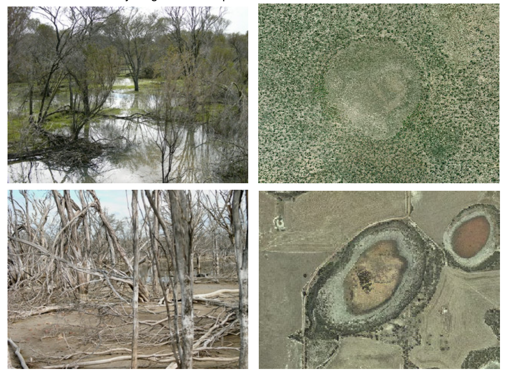
Figure 3 - Top - a freshwater basin in good condition, pictured on the ground (left) and from aerial photography (right). Bottom – a secondarily salinised basin, pictured from the ground (left) and from aerial photography (right)