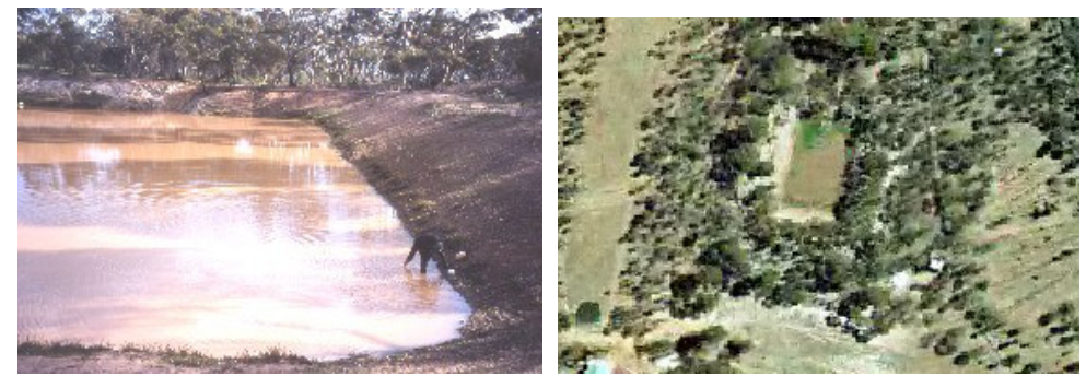
Figure 4 - A freshwater artificial reservoir basin pictured from the ground (left) and aerial photography (right)