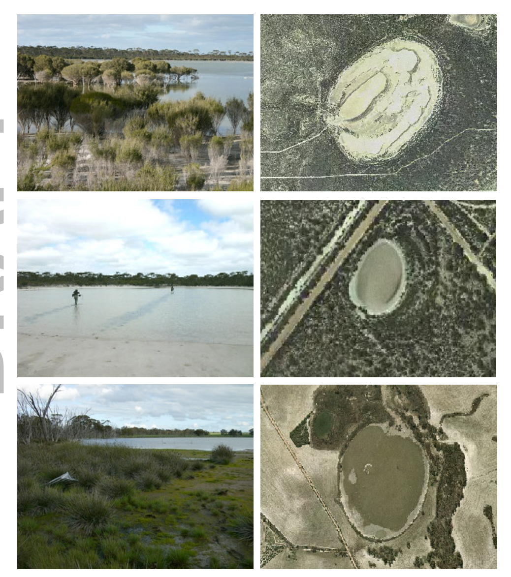
Figure 2 – Top and middle - a naturally saline basin in good condition pictured from the ground (left) and aerial photography (right). Bottom – a degraded naturally saline basin, pictured from the ground (left) and from aerial photography (right)