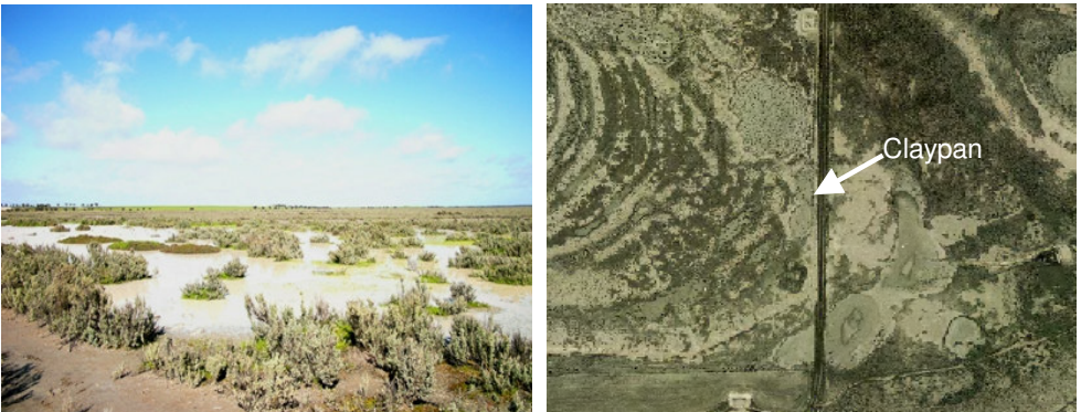
Figure 5 - Typical freshwater claypan south of Lake Grace. Pictured from the ground (left) and from aerial photography (right)