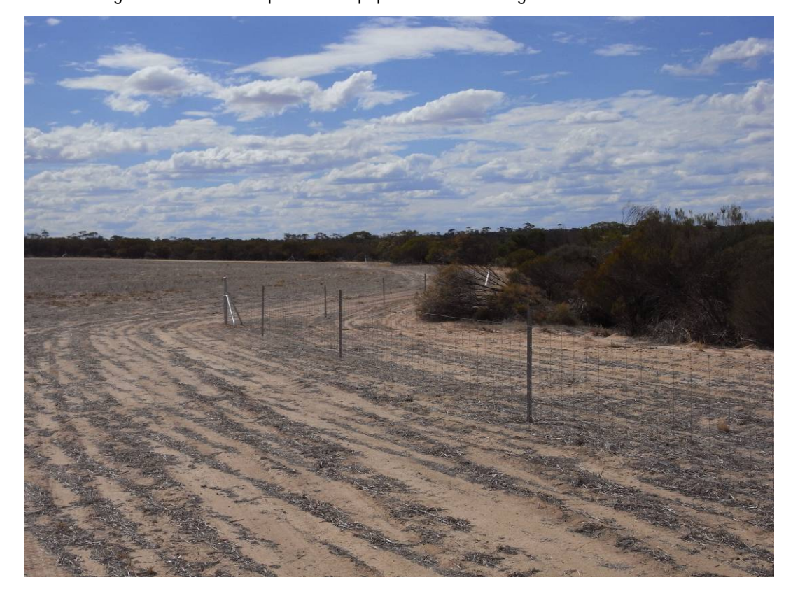
Figure 1: Part of fence installed around Eremophila viscida population 12C