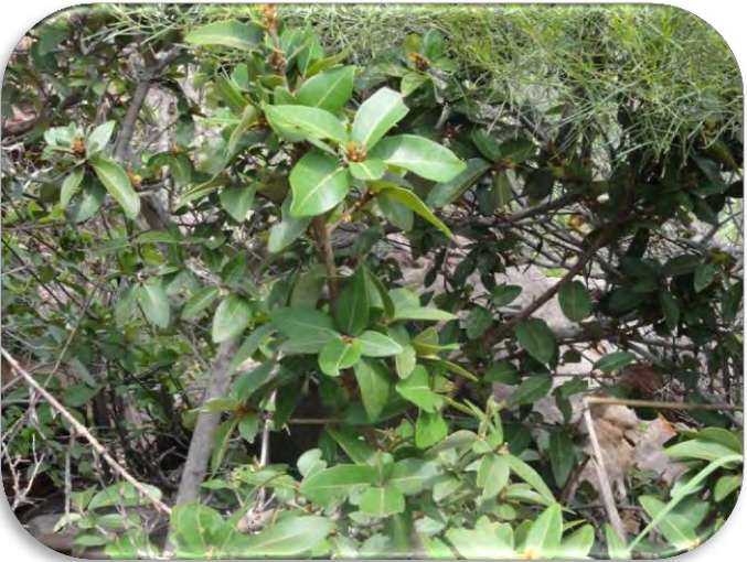
Bush olives on Niiwalarra Island.