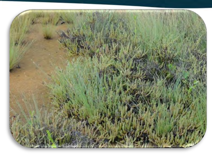
Tecticornia sp. on Niiwalarra Island.

There have been minimal surveys of plants on Lesueur Island. The few plant collections in the WA Herbarium for Lesueur Island<sup>14</sup> are listed under Table 3.