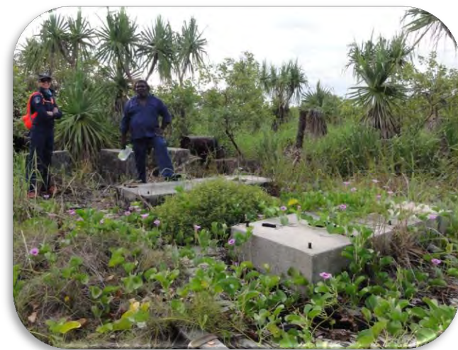
Remnants from the LORAN site.

Using a network of terrestrial transmitting sites, the LORAN radio navigation station gave ships and aircraft the ability to get a fix on their location within a few hundred feet by using the difference in the timing of two or more signals from the stations (DEE 2018). The Niiwalarra station was one of three stations in northwest Australia - Niiwalarra Island, Bathurst Island and Champagny Island. The site consisted of a radar building, radio building, a powerhouse and a campsite. Concrete foundations are mostly all that remain today (Peet 1997; Fenton 1999; DEE 2018). Also left on the island near the WWII site are empty rusty 44 gallon drums, which contained fuel to power the LORAN and further east are parts of the distillation plant that produced distilled/fresh water (Peet 1997; Fenton 1999; Ralph 2003).