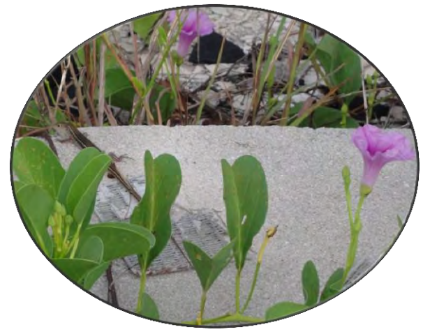
Skink (Ctenotus inornatus) among Beach Morning Glory (Ipomoea pes-caprae) on Niiwalarra Island.

"[Niiwalarra Island] was a meeting place because of the turtles, lots of people came here. [We] used big animals like turtles and dugong, for smoking, sorry business" [Bernadette Waina]