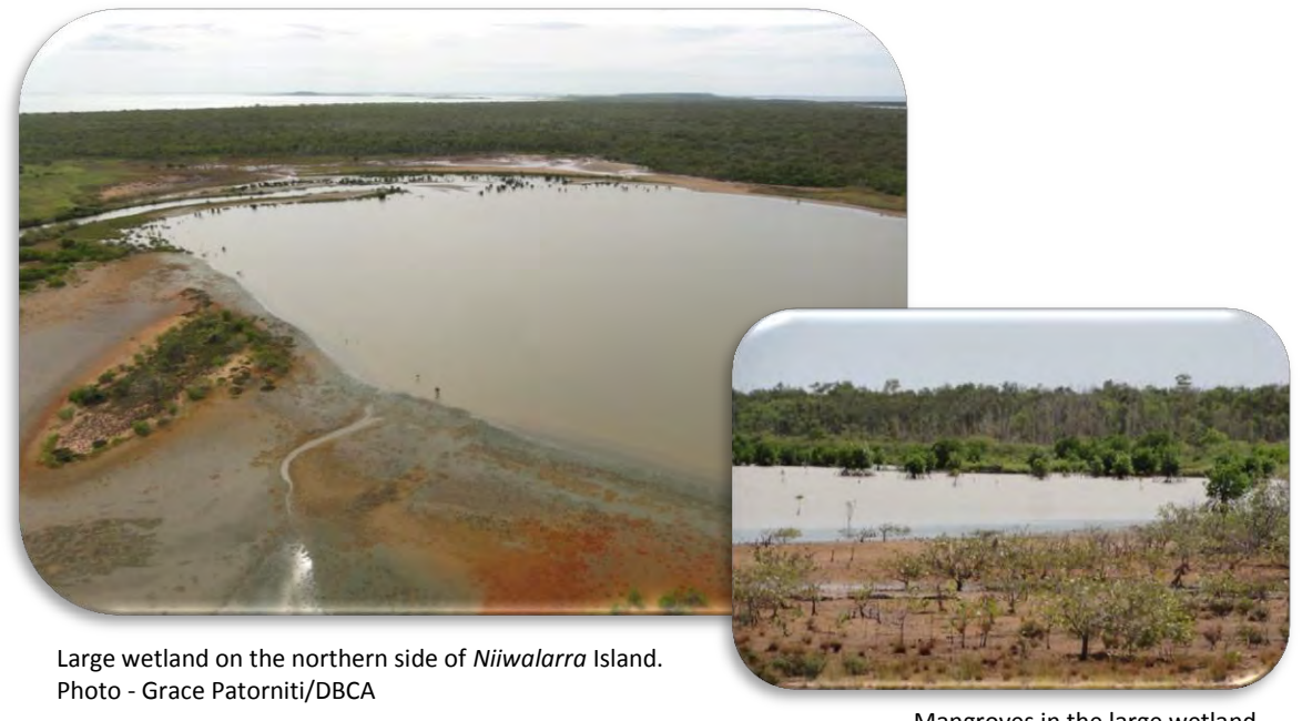
Mangroves in the large wetland.

Three wetlands occur on Niiwalarra Island. The largest and likely permanent wetland, on the north side of the island, probably varies between fresh and brackish depending on the relative seasonal input of major rain events and tidal influence. It includes drainage lines with mangroves and is surrounded by saline coastal flats dominated by samphire ( Tecticornia spp.) along the wetland margin and coastal flats. Another, smaller perennial wetland in the south-west of the island, formed by coastal dunes barring drainage, supports a closed sedgeland surrounded by low closed forests of Melaleuca. Near the northwest tip of the island a Melaleuca swamp ( Melaleuca viridiflora ) probably fills after major wet season rainfall. It supports rich herb and sedge assemblages on its' margins, and the only known Kimberley island record of tropical reed ( Phragmites karka ). Several tidal saline coastal flats with fringing mangrove communities occur in some of the deeper embayments on the southern shores of Niiwalarra Island. Smaller freshwater seepages and small seasonal creeks occur on Niiwalarra Island and may also occur on the other islands.