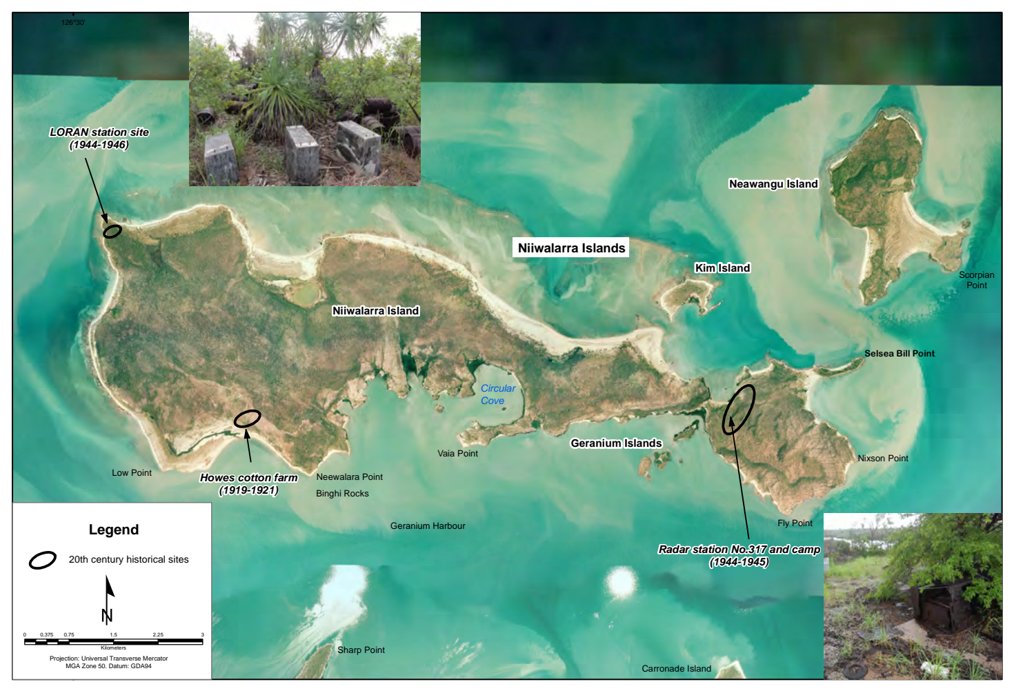
Map 2: Niiwalarra Islands and Lesueur Island: Heritage sites