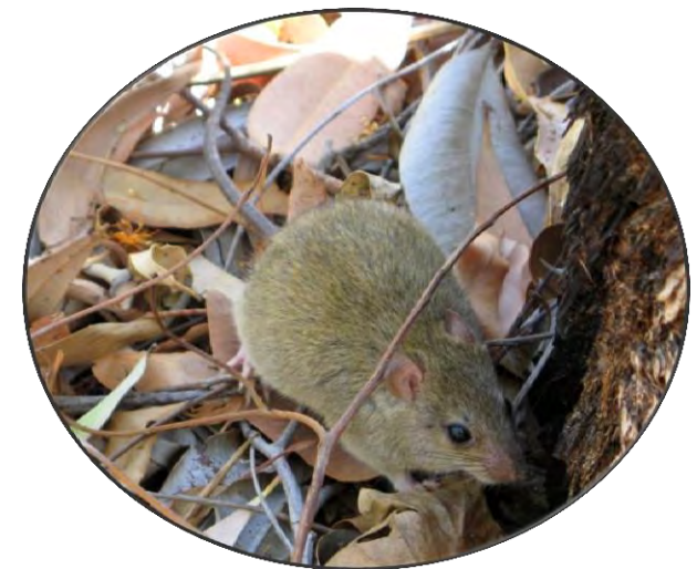
Melomys burtoni on Niiwalarra Island.