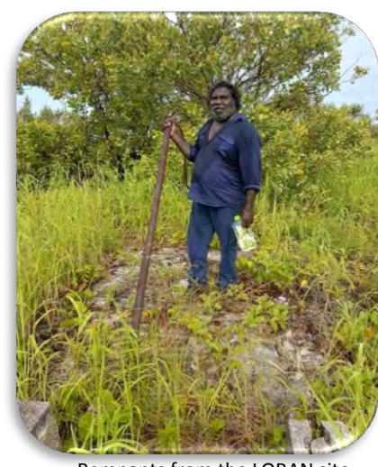
Remnants from the LORAN site.