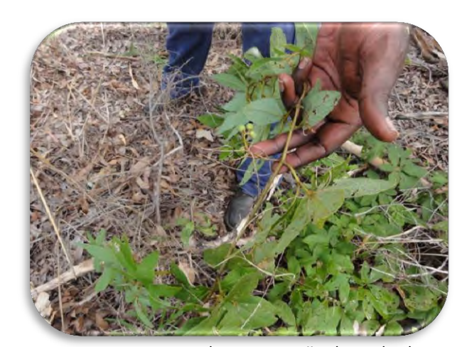
Bush grapes on Niiwalarra Island.

Connection to country means they have responsibility to look after country. Some plants and animals are especially important to traditional owners, and their presence in the planning area and wider Balanggarra country is one indicator of the cultural significance of the area. Plant foods identified by Kwini people as being locally important on Niiwalarra Island are listed under Table 2.