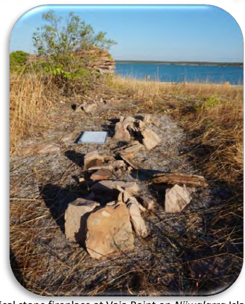
Historical stone fireplace at Vaia Point on Niiwalarra Island.

From 1817 – 1822 the Kimberley coastline was extensively explored and mapped during four expeditions by Lieutenant Phillip Parker King; the surveys involved the naming of coastal features including naming Sir Graham Moore Island (Battye 1912; Burbidge and McKenzie 1978). The island was originally named in 1819 after Sir Graham Moore, whom was then holding a seat on the English Admiralty Board (Conservation Commission of WA 2010).