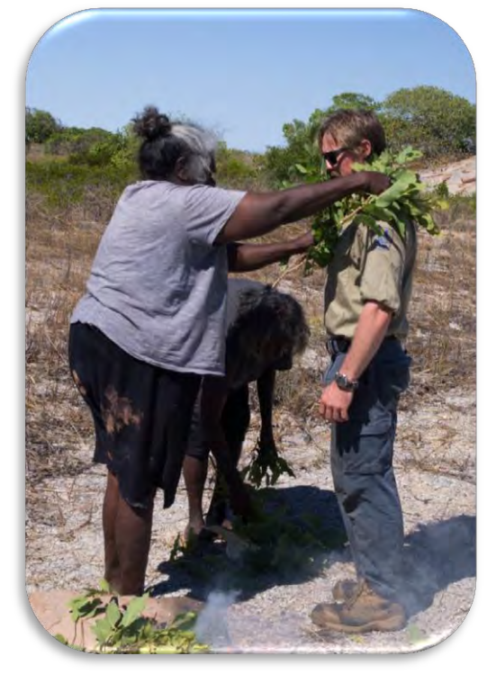
Smoking ceremony during an on-country trip at Niiwalarra Island.