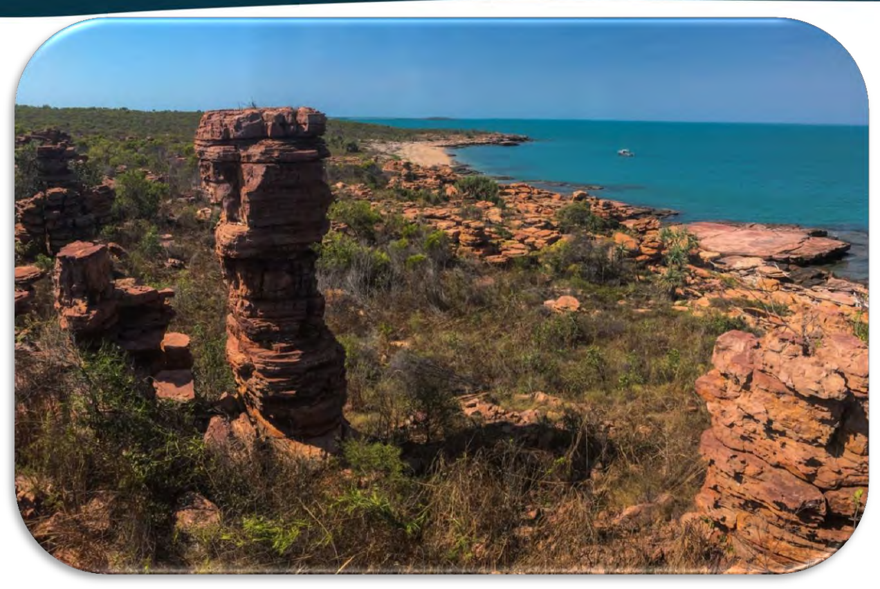
Weathered and exposed landforms of Niiwalarra Island.

Three wetlands occur on Niiwalarra Island. The largest and likely permanent wetland, on the north side of the island, probably varies between fresh and brackish depending on the relative seasonal input of major rain events and tidal influence. It includes drainage lines with mangroves and is surrounded by saline coastal flats dominated by samphire ( Tecticornia spp.) along the wetland margin and coastal flats. Another, smaller perennial wetland in the south-west of the island, formed by coastal dunes barring drainage, supports a closed sedgeland surrounded by low closed forests of Melaleuca. Near the northwest tip of the island a Melaleuca swamp ( Melaleuca viridiflora ) probably fills after major wet season rainfall. It supports rich herb and sedge assemblages on its' margins, and the only known Kimberley island record of tropical reed ( Phragmites karka ). Several tidal saline coastal flats with fringing mangrove communities occur in some of the deeper embayments on the southern shores of Niiwalarra Island. Smaller freshwater seepages and small seasonal creeks occur on Niiwalarra Island and may also occur on the other islands.