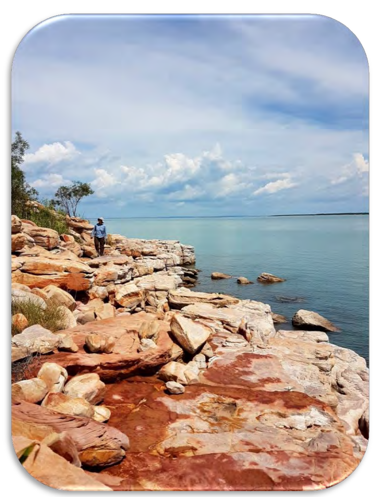
Sandstone of Niiwalarra Island.

The eastern more elevated end of the island features a Mesa underlain by basalt and capped by iron-rich duricrust (laterite). The remainder of the eastern section is dominated by King Leopold Sandstone with small areas of beach sand and dunes at the northeast tip of the island (Philips and de Souza Kovacs 2016).