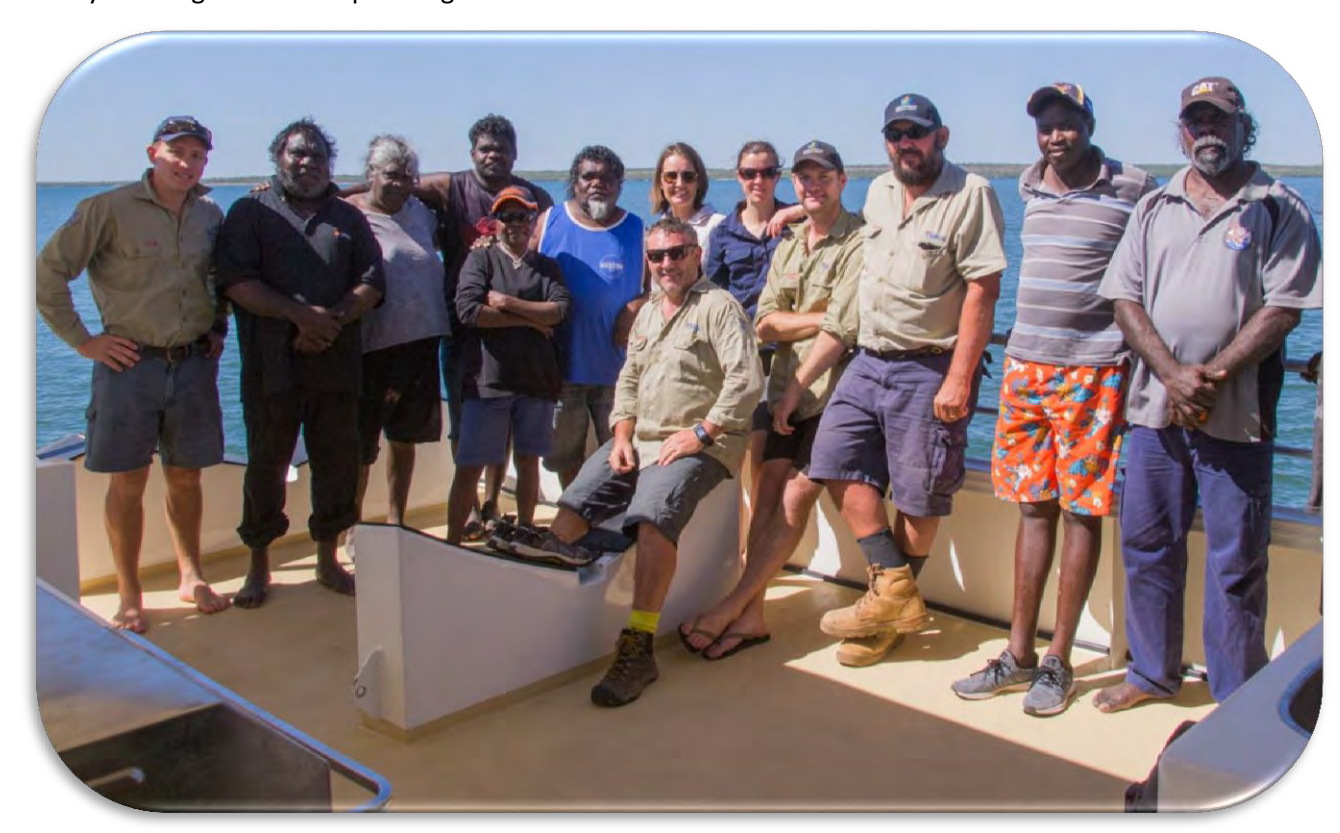
Kwini people and DBCA staff during on-country trip to Niiwalarra Island in 2017.

This draft management plan takes into account the values, aspirations and objectives articulated in the Healthy Country Plan and discussions between Kwini people and DBCA staff, including a series of oncountry meetings within the planning area in 2017 and 2018.