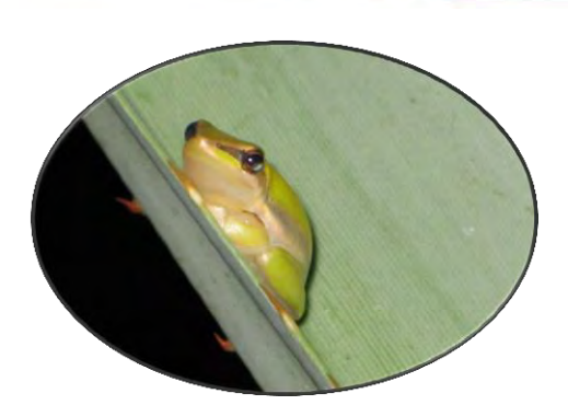
Litoria bicolor on Niiwalarra Island.

The natural values of Lesueur Island include a significant Mardumarl manya or Flatback Turtle ( Natator depressus) rookery and importance as a seabird breeding island with habitat to support high volumes of seabird breeding (Conservation Commission of WA 2010). There is a known breeding colony of Bridled Tern (Sterna anaethetus) with breeding recorded in 1978, 1982 and 2000, and Naabûlo manya or Osprey (Pandion cristatus) with breeding recorded in 1973 (Burbidge and McKenzie 1978; Abbott 1979<sup>18</sup>, Swann 2000, 2004; Conservation Commission of WA 2010). Also observed at Lesueur Island are Silver Gull (Larus novaehollandiae) (four) and Crested Tern (Sterna bergii) (18) and Gilbert's Dragon (Lophognathus gilberti) (Abbott 1979). Lesueur Island has the only known island population of Gilbert's Dragon or Ta-Ta lizard in the North Kimberley.