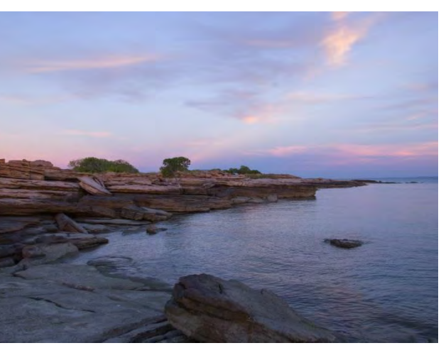
Niiwalarra Island.

To jointly manage the islands to protect and learn about Kwini cultural and natural heritage for the benefit of traditional owners, future Kwini generations and visitors, and to support ongoing connections to country.