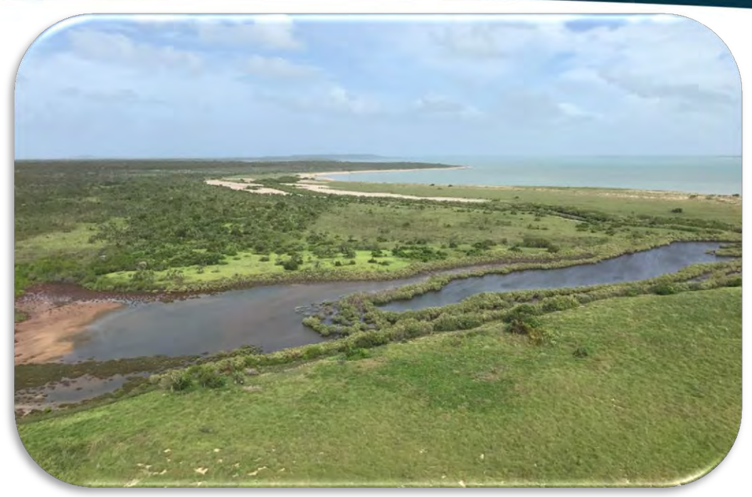
Smaller wetland on the south-western side of Niiwalarra Island.

Neawangu Island is dominated by King Leopold Sandstone. A large area of beach sands with a well-developed series of consolidated dunes occurs in the southern portion of the island (Philips and de Souza Kovacs 2016). On the central western coast, a large wetland (that probably fills seasonally) is set between the sandstone and beach sands, draining to the sea along a narrow mangrove lined creek.