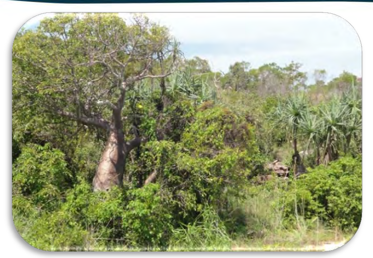
Brachychiton sp. and Pandanus sp. on Niiwalarra Island.