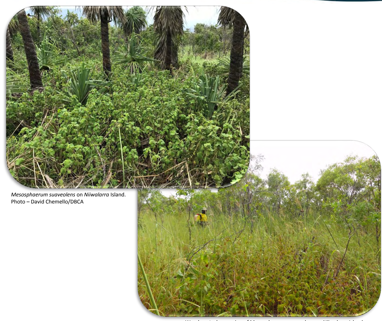
Weed control - spraying of Mesosphaerum suaveolens on Niiwalarra Island.

The high impact, rapidly invasive weeds Passiflora foetida and Hyptis suaveolens (now known as Mesosphaerum suaveolens ) are found across the Kimberley. The extent of the two weeds on Niiwalarra Island is unknown with known occurrences of M. suaveolens around the previous WWII operational sites located on Niiwalarra Island (DPaW 2015). A program is in place for traditional owners and DBCA staff to control isolated populations of M. suaveolens from Niiwalarra , including around WWII artefacts [where there is visitation and increased risk of spread], and to monitor the island for these and other infestations.