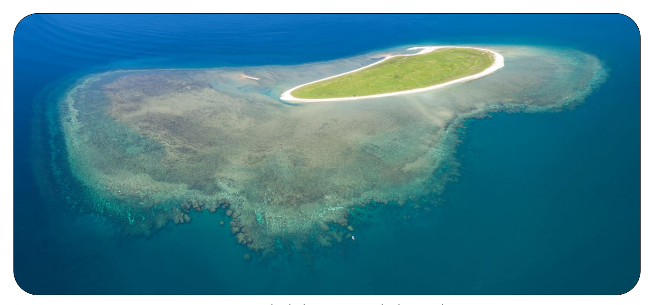
Lesueur Island.

The management issues and the potential impacts to the key values are addressed in the management strategies presented throughout the plan. Background text in each section supports and explains the key values, management issues and strategies (also see the section Performance assessment ).