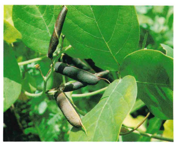
Pods of the Augusta Kennedia.

The Augusta Kennedia is probably killed by fires and regenerates from seed. The seedlings are fast growing.