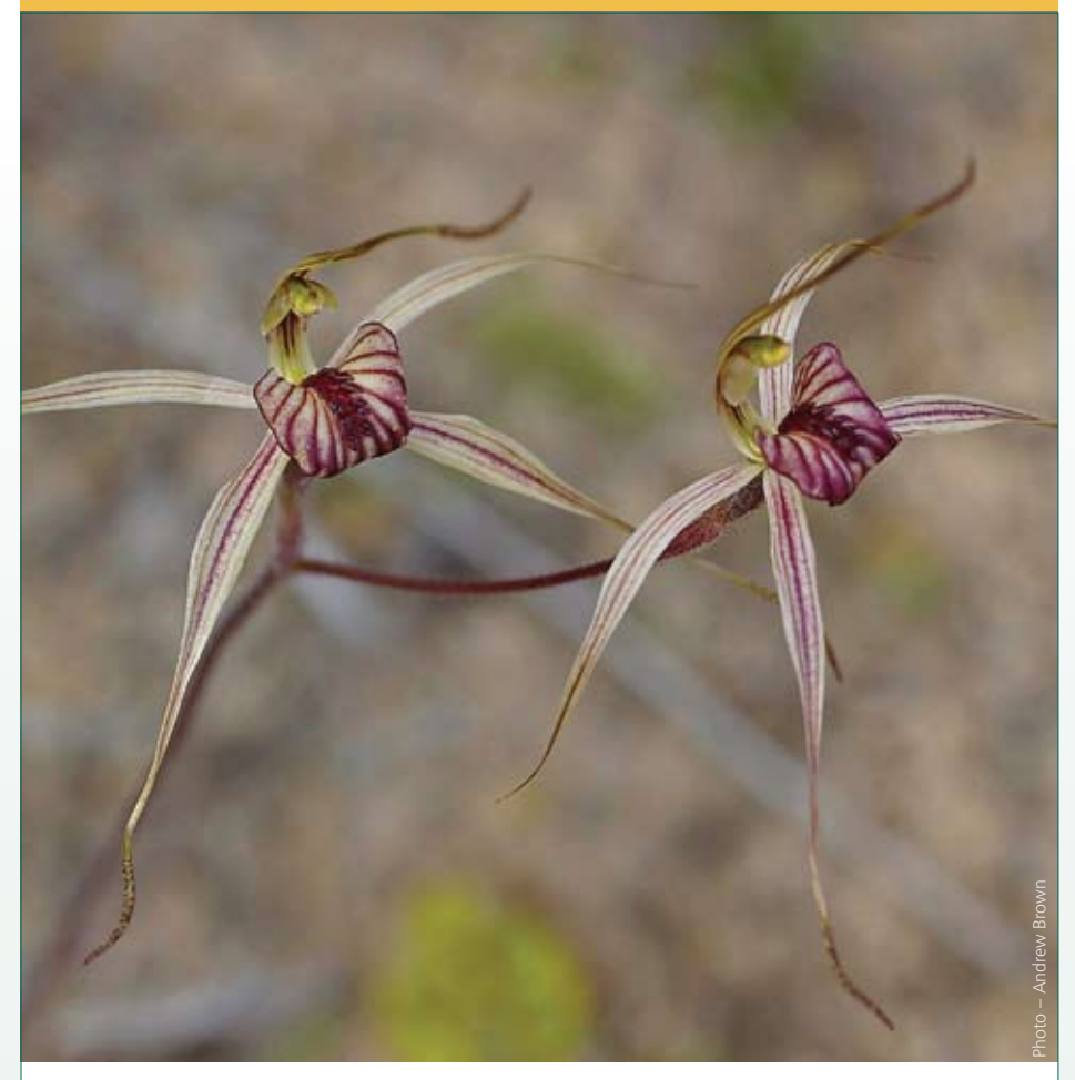
Habitat Sandstone outcrops, the top edges of gorges and open woodland

Description An orchid three to eight centimetres tall Flowering time August to September