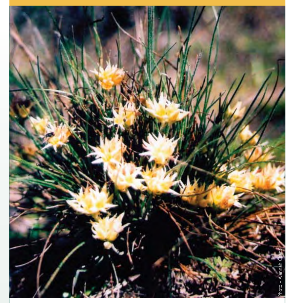
Habitat Heath, scrub and low open woodland Description A herb 13 to 33 centimetres tall Flowering time July to August