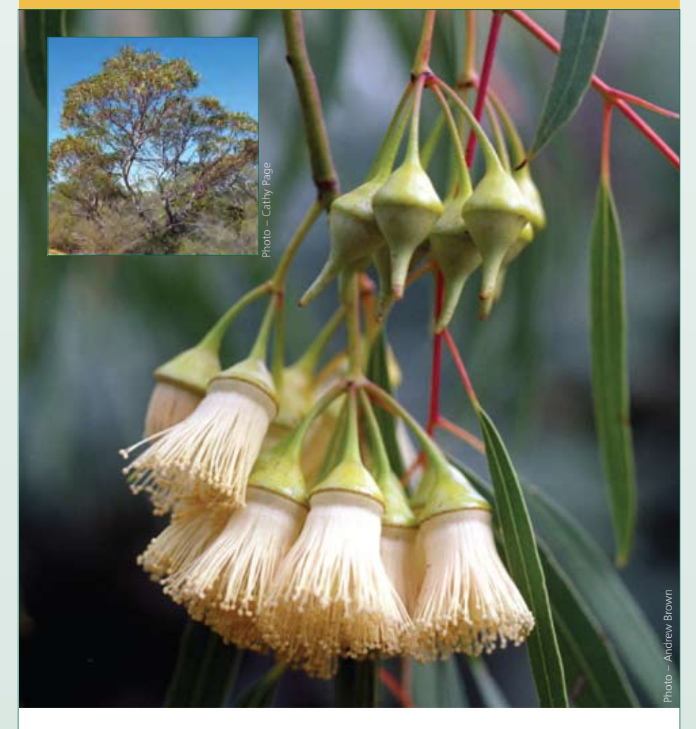
Habitat Sand dunes and ridgesDescription A mallee tree three to five metres tallFlowering time August to September

For more information, or if you have seen these plants, please contact the Department of Environment and Conservation's Geraldton District Office on (08) 9921 5955.