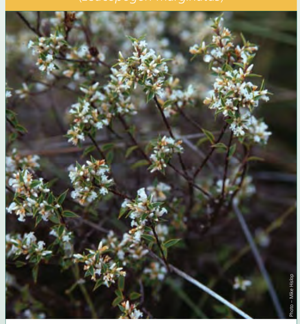
Habitat Shrubland and heathDescription A shrub 0.4 to one metre tallFlowering time July to August