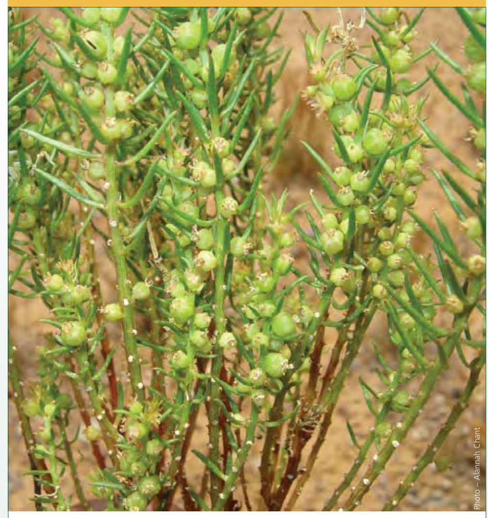
Habitat Dense shrubland in disturbed areasDescription A shrub to one metre tallFlowering time August to December