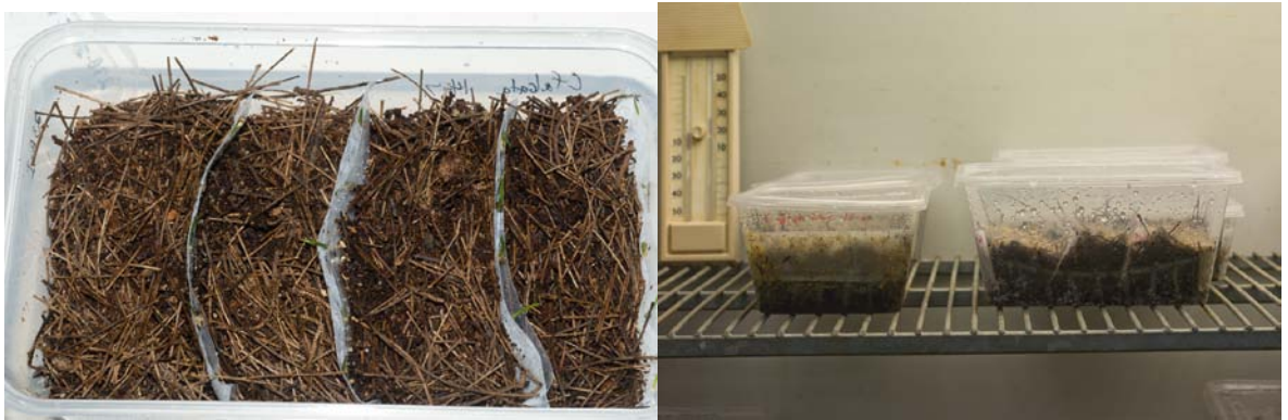
Figure 4. Spider orchid seedlings in pouches growing in an incubator.

Figure 3. Seedling of the Granite Spider Orchid after transfer into growing pouches placed in potting mix inoculated with compatible fungi.