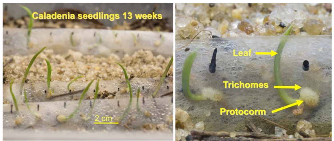
Figure 3. Seedling of the Granite Spider Orchid after transfer into growing pouches placed in potting mix inoculated with compatible fungi.

Once they had grown to sufficient size for transfer to the field of glasshouse, seedlings were placed in larger pouches in a growth cabinet until they reach sufficient size for establishment in soil (Fig. 4). Results of these experiments are described in WOR Reports 7 and 8.