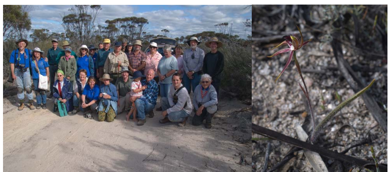
Figure 1. A large group of volunteers from WANOSCG conducted surveys at Dragon Rocks Nature Reserve. This photo was taken at the location of new sub-population they discovered approx. 1 km from previously known plants (right photo).