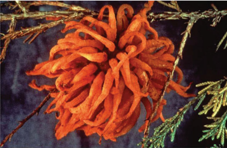
Plate 3 Cedar-Apple Rust on Cedar caused by Gymnosporangium juniperi