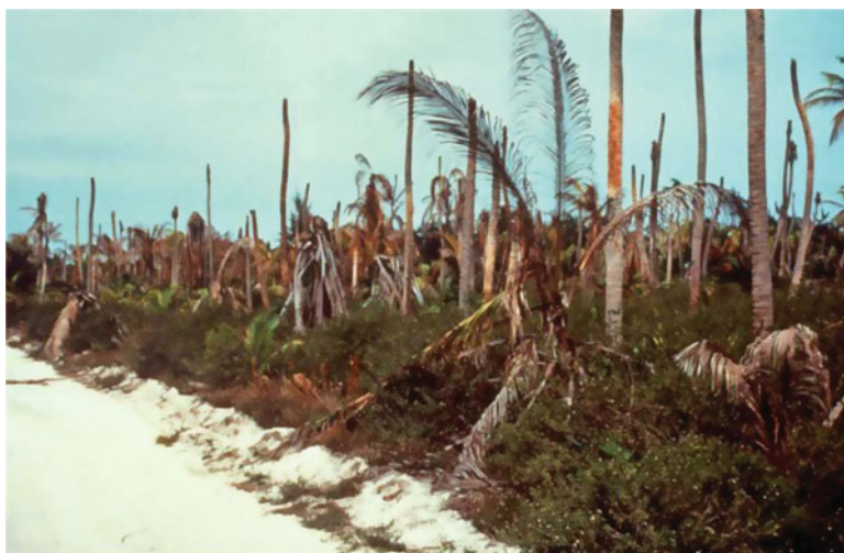
Plate 1 Lethal Yellowing on Coconut Palm caused by a Phytoplasma pathogen