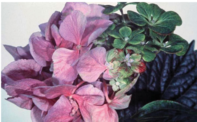
Plate 5 Phyllody on Hydrangea caused by a Phytoplasma Pathogen