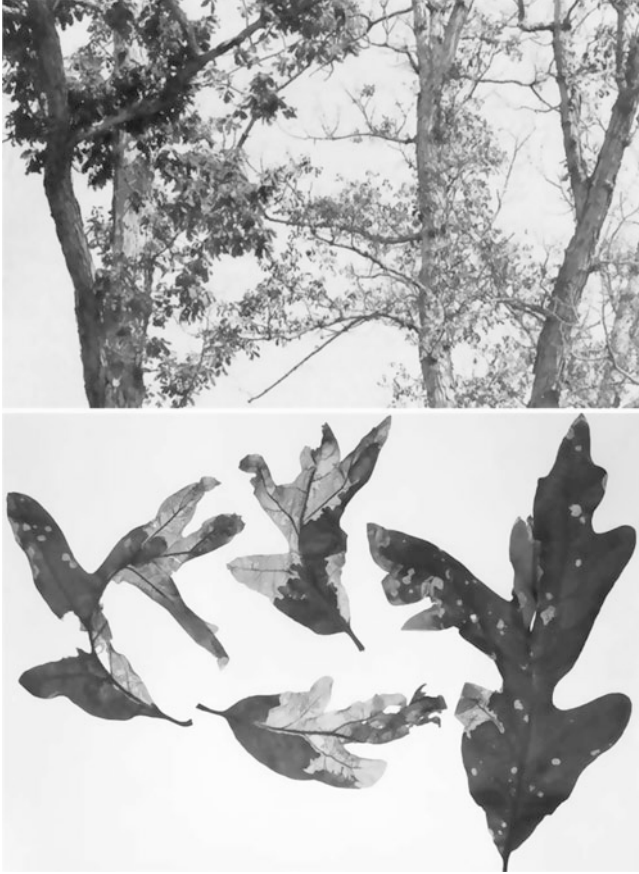
Plate 6 Oak Anthracnose