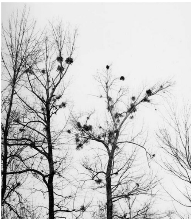
Plate 11 Mistletoe, Common in Southern trees