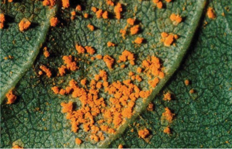
Plate 2 Cedar-Apple Rust on Apple caused by Gymnosporangium juniperi-virginianae