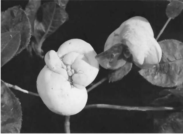
Plate 9 Azalea Leaf Gall