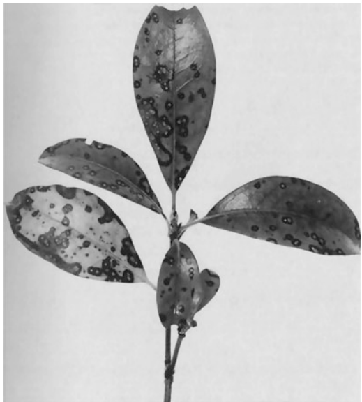
Plate 10 Phyllosticta Leaf Spot on Mountain-Laurel