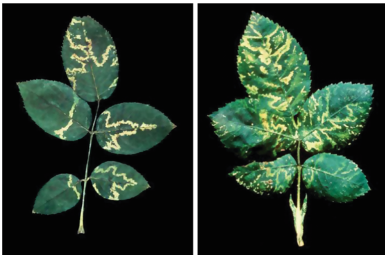
Plate 4 Mosaic on Rose caused by Prunus Necrotic Ringspot Virus