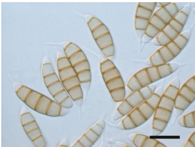
Fig. 2. Conidia (ex culture, VPRI 15696) of an Australian isolate of Seiridium cupressi . Note that the appendages follow the curve of the spores. Scale bar = 15 \mu m.

and examined using interference contrast. The conidial appendages from all the cultures and most of the herbarium specimens were found to follow the curve of the conidia (Fig. 2) as is typical for S. cupressi . Herbarium specimens of S. cupressi from south-eastern Australia were examined on Cupressus (VPRI 21924, 31573, 32082), Sequoiadendron (VPRI 24940), Cupressocyparis (VPRI 22467), Chamaecyparis