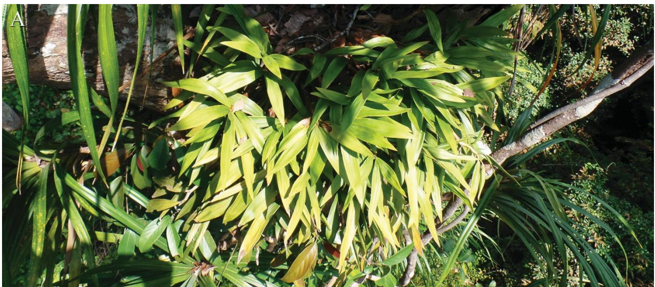
Fig. 2. A large clump of Pinalia floribunda was found growing on a 30-m tall Pentace triptera (Malvaceae) tree. (Photograph by: Clayton Lee).

The specimen collected is now growing in Singapore Botanic Gardens' orchid nursery. The plant has been divided into cuttings consisting of five to six pseudobulbs each. The cuttings were planted in a growing medium consisting of charcoal