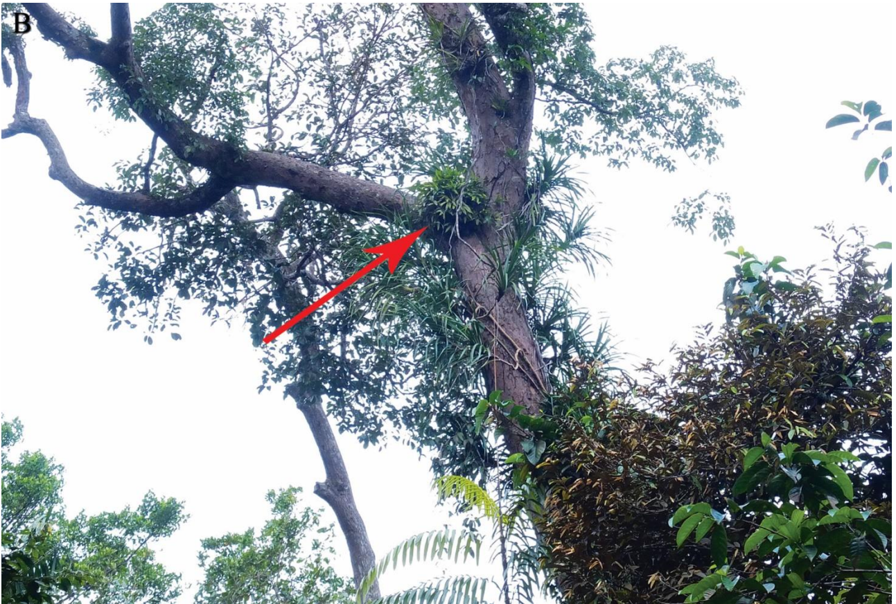
Fig. 3. Crown of the tree in the Nee Soon Swamp Forest where Pinalia floribunda was rediscovered. (Photograph by: Paul K.F. Leong).