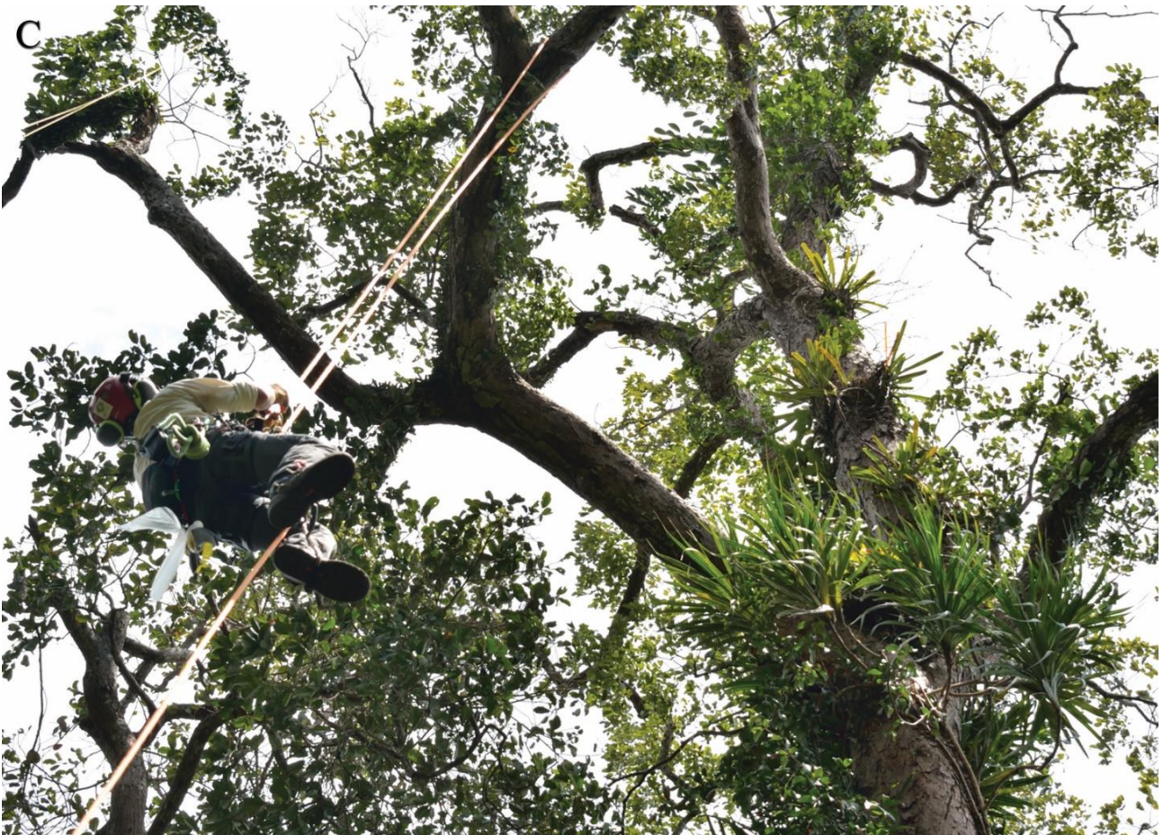
Fig. 4. Clayton Lee collecting the rediscovered Pinalia floribunda from the Pentace triptera tree.