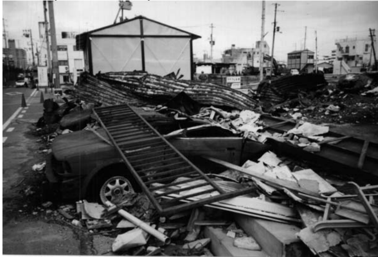
Kobe, Japan, after the earthquake