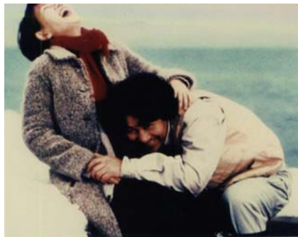
Misa Shimizu and Koji Yakusho in Warm Water Under a Red Bridge (2001), part of the Fall 2002 Film Series.