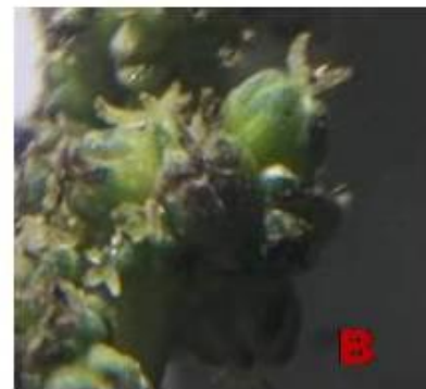
Male stage (A) and Female stage of the flower (B)

Identification of three lichen species, namely, Graphis sp., Lecanora sp. & Pyxine sp. from mangrove habitats in Sindhudurg district . However, in Mumbai we could find Lecanora sp. in Charkop and Gorai area only. It gives an indication of its surroundings. For. Eg. Lecanora sp. indicates their tolerance to hot, humid and saline air.