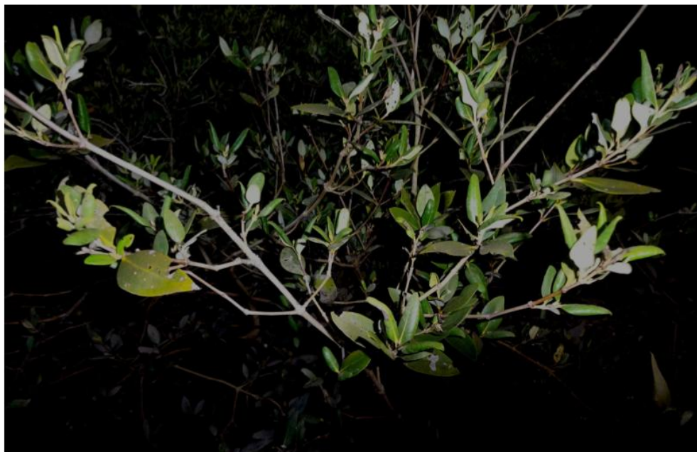
Avicennia marina (Forsk.) Vierh. var. acutissima Stapf ex Moldenke forma pumila (forma nov.)

The key to identify the Avicinnia marina from its variety and forma is as follows: