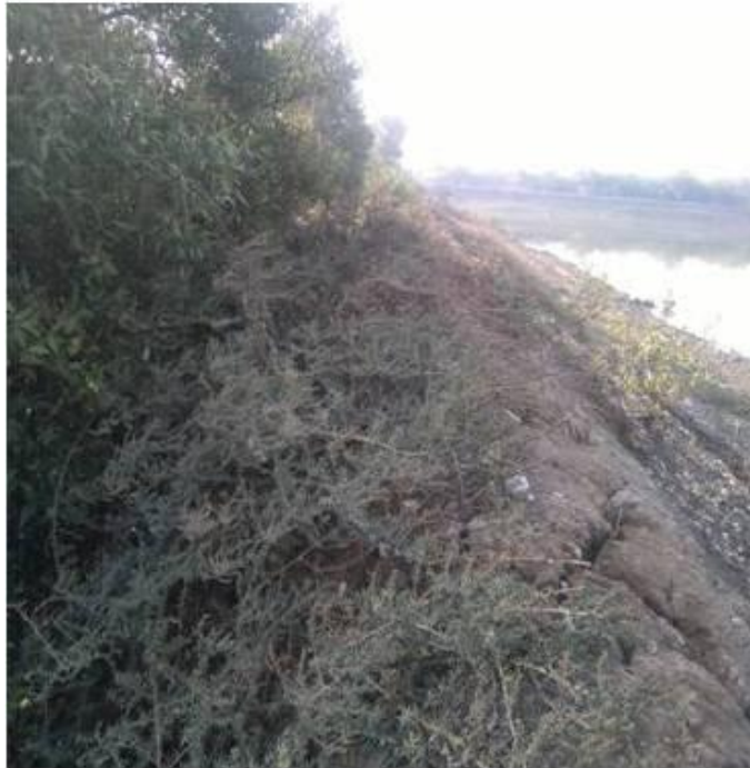
Spreading habit of Suaeda fruticosa Forssk. Ex Gmel

Identity of Suaeda: Earlier botanists have recorded Suaeda maritima as well as S. nodiflora from the saline habitat under mangrove projects. However, we could not find these two species of Suaeda during our study. But, recorded Suaeda fruticosa from Naigaon, Vasai areas. This species shows 3 stigma, and the bract is entire.