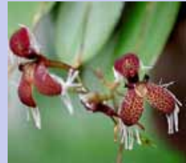
Pths. ornata

current and/or correct name. (You'd think they'd be one and the same, but not always.) There are two reasons for this: First, I've always enjoyed taxonomy and systematics, and orchids allow a unique opportunity to practice that hobby. Second, I appreciate any scientific enterprise that serves to bring the experts down to my level of ignorance.