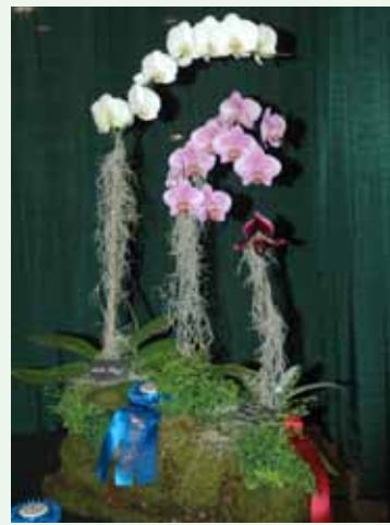
First Place Hobbyist Exhibit, 3 Blooming Orchids Table-Top, William Soyke