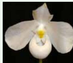
First Place, Grower's Choice Paphiopedilum, Paph. delenatii f. alba , Clark Riley