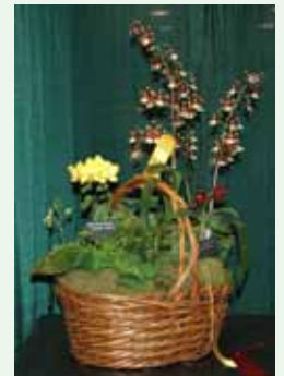
3 Blooming Orchids Table-Top, Patti Kelt