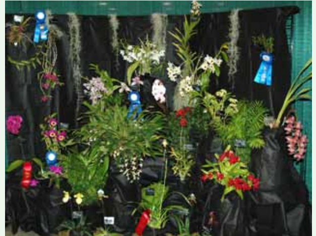
Third Place Hobbyist Exhibit, 25-Square-Foot, Cyrus Swett