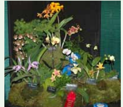
9-Square-Foot Table Top Exhibit, Sarah Spence