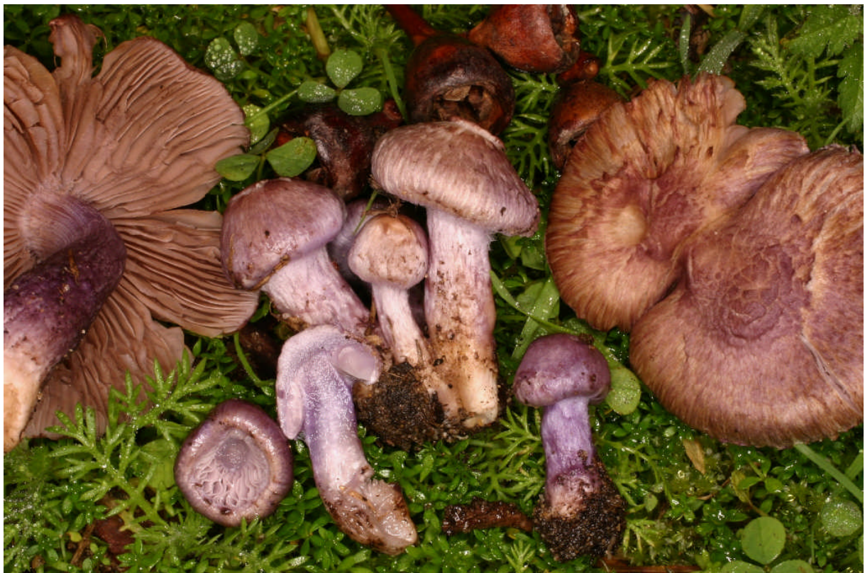
Figure 3. Basidiomata of Inocybe violaceocaulis (E8055) collected under introduced Eucalyptus maculata and Lophostemon (Tristania) confertus in Perth, Western Australia.