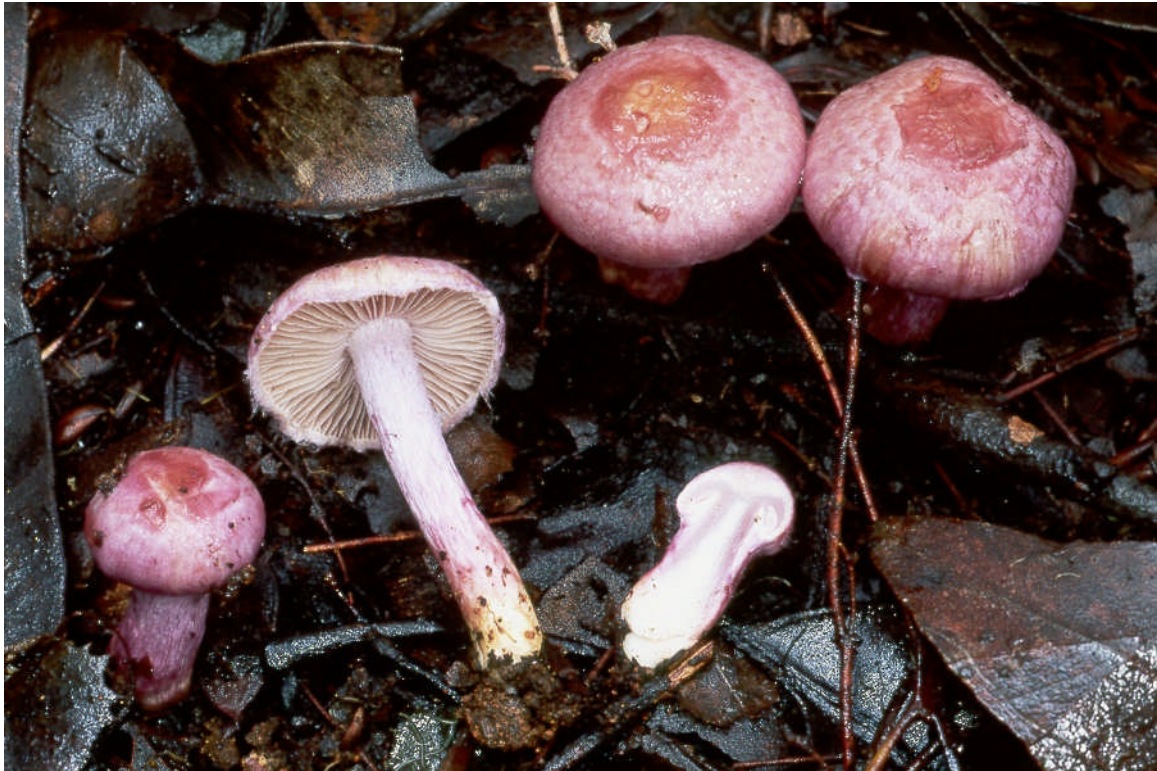
Figure 2. Basidiomata of Inocybe violaceocaulis (E7045) in native Eucalyptus diversicolor (Karri) forest, Karri Valley, Western Australia.